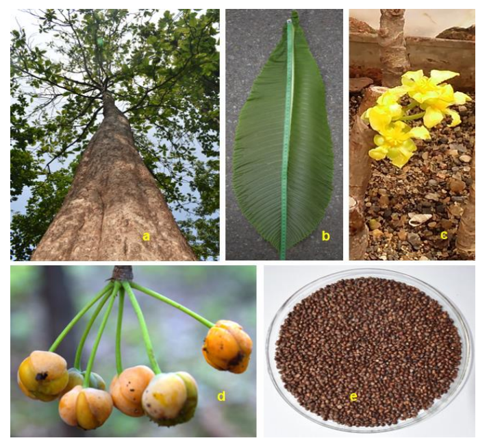
Figure 2: Dillenia pentagyna: a) Tree b) Leaf c) Flower d) Fruits e) Seeds

D. pentagyna is a moderate deciduous tree with an approximate height of 15-18m and a girth length ranging from 80-90cm (Fig 2(a)). The bark of the plant is an exfoliating, smooth, and greyish colour. The branches are ascending and drooping at the ends, when old they become scarred. The leaves are alternate, petiolate, globous, oblong to obovate with an approximate size of 20-60 x 10-25cm (Fig 2(b)). The leaf shows reticulate venation with about 20-50 secondary veins on either side. These secondary veins are parallel to each other. The margin of the leaf is slightly denticulate with the apex being obtuse subacute. Flowers are bright yellow measuring 2-3cm in diameter, and pedicels (2-4cm) and bracts are deciduous (Fig 2(c)). They are found on leafless old branches. The sepals (5) are thick and ovate whereas the petals (5) are lanceolate and possess fragrance. The flower possesses multiple free stamens and is postcapillary. Fruit is yellow, sub-globose 1-2 seeded, and is enclosed by fleshy sepals (Fig 2(d)). The seeds are black, ovoid, and glaucous (Fig 2(e))<sup>[4,5]</sup>.