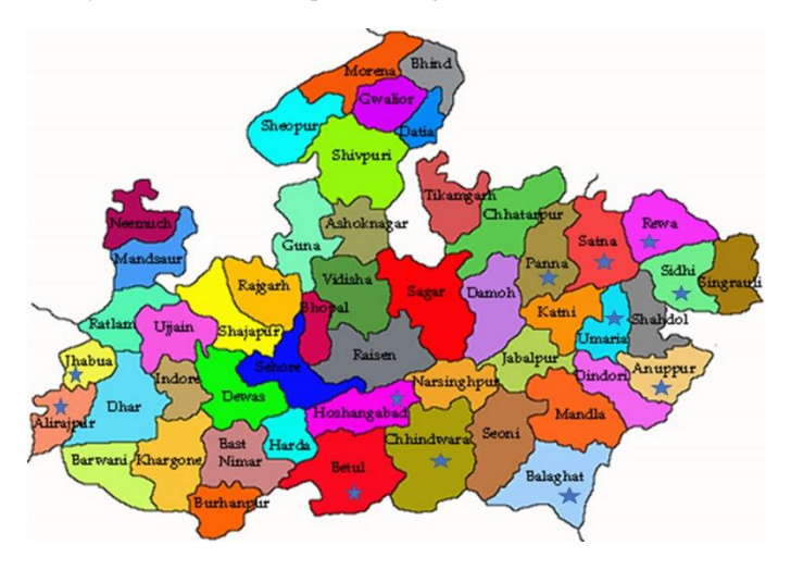
Figure 1: Distribution of D. pentagyna in Madhya Pradesh state

D. pentagyna is distributed in rain forests, thickets as well as in the hills below 400 m. Hainan, Yunnan in Bhutan, India, Indonesia, Malaysia, Myanmar, Nepal, Thailand, Vietnam. In India, it is distributed in Himalayan terrain, also from Punjab to Assam, South India, Andamans, Gujarat, Mizoram and West Bengal. Predominantly found in various districts of Central India such as Ali Rajpur, Chinaware, Reiwa, Umari, Siddhi and Reiwa <sup>[4]</sup>. Its distribution in Madhya Pradesh state is depicted in Fig. 1.