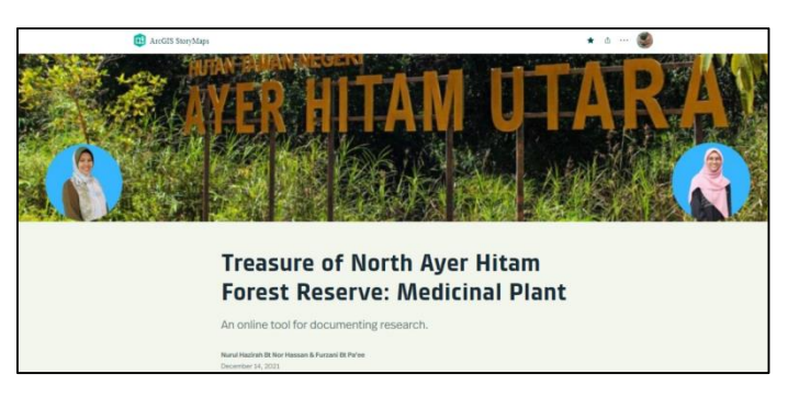
Fig. 2 - Website developed using StoryMap ArcGIS

An online survey was distributed to UTHM students and staff. The survey was divided to three parts namely Part A which is the demography part, Part B is knowledge on Ayer Hitam Utara Forest Reserve and medicinal plants and Part C is feedback on the website. This website available at <a href="https://storymaps.arcgis.com/stories/c9390923f5964d8aafaded164b496d01">https://storymaps.arcgis.com/stories/c9390923f5964d8aafaded164b496d01</a>.