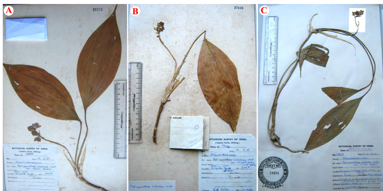
Fig. 1. Peliosanthes arunachalensis . A. Holotype (G. K. Deka s.n., ASSAM!, Acc. No. 38205). B. Isotype (G. K. Deka s.n., ASSAM!, Acc. No. 37430). C. Paratype (R. S. Rao 17800, ASSAM!, Acc. No. 19488).

Description. Stoloniferous, terrestrial herbs; stolons with internodes to 20–25 cm long, 0.5 cm in diam., covered with remnants of whitish scarios scales on nodes. Cataphylls lanceolate, 5–10 × 0.7–1.0 cm, papyraceous, later becoming partially disintegrated. Leaves 2, petiolate, suberect; petiole rigid, almost straight, terete, 13–20 cm long; leaf blade broadly elliptic, 16.5–21.5 × 5.5–8.5 cm, acuminate to shortly attenuate, entire along margins, glabrous, glossy; longitudinal veins many, prominent; secondary veinlets conspicuous, spaced, sub-perpendicular to main veins. Scape axillary, bearing 1–2 sterile bracts, stout, elongated, longer than raceme, 12–14 cm long, ca. 2 mm in diam.; sterile bracts 1.2–2.0 × 0.3–0.5 cm, acuminate, margins membranous. Raceme 2–3 cm long, 7–10-flowered; rachis longitudinally finely ridged. Floral bracts 2, scarios; bract located below flower, lanceolate, 0.8–1.0 cm long, 1.5–2.0 mm wide, distally acuminate to subulate, concave, equal or shorter than the flower;