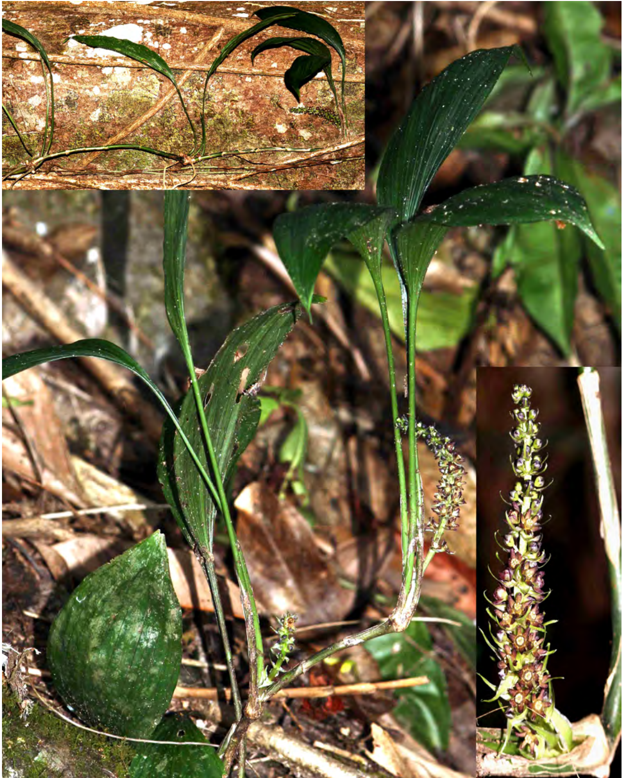
Fig. 3. Peliosanthes sinica .

obconical, 2–3 mm long; segments 6, similar, ovate to ovate-triangular, obtuse, 6.5–7.5 mm long, 4–4.5 mm wide, spreading, slightly incurved at margins. Corona broadly conic, its base scarcely demarcated from tepals, 4.0–4.5 mm across, about 3 mm high, distinctly hexagonal. Anthers 6, sessile, introrse,