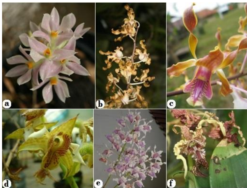
Figure 2. Highly economical value of orchid species. a. Dendrobium bracteosum ., b. Dendrobium discolor ., c. Dendrobium lasianthera ., d. Dendrobium macrophyllum ., e. Dendrobium nindii ., and f. Dendrobium spectabile . Figure 2. Highly economical value of orchid species. a. Dendrobium bracteosum ., b. Dendrobium discolor ., c. Dendrobium lasianthera ., d. Dendrobium macrophyllum ., e. Dendrobium nindii ., and f. Dendrobium spectabile .