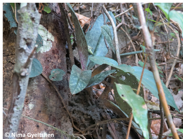
Image 2. Paphiopedilum venustum growing on humus rich leaf litter, Kaktong, Zhemgang.

The lowest altitudinal record of a P. fairrieanum habitat is near Aalay at about 600m and the highest known is in Mongar at 1,400m. Pearce & Cribb (2002), however, noted the altitude range of P. fairrieanum to be between 1,400m and 2,200m. This suggests that the search for P. fairrieanum in Bhutan should extend to