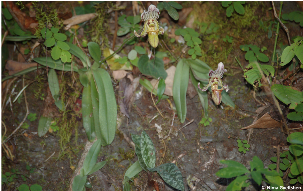
Image 1. Paphiopedilum fairrieianum and P. venustum growing side by side, Ngangla, Zhemgang.

Pabji site which was known to harbour both P. fairrieianum and P. venustum (Dorji 2008) is now devoid of the latter. Similarly, a healthy population of P. venustum