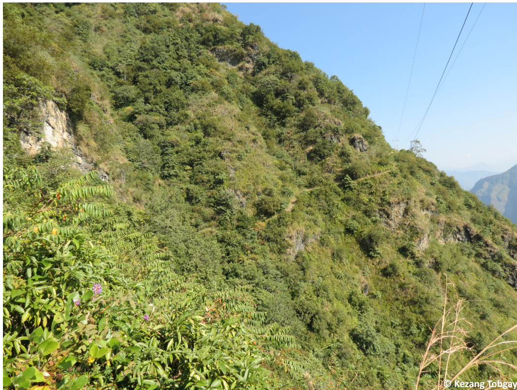
Image 4. Paphiopedilum fairrieianum habitat with power lines passing over a foot path, Gongdu, Zhemgang.