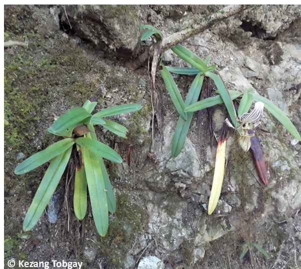
Image 3. Paphiopedilum fairrieianum growing on limestone cliff, Ngangla, Zhemgang.

Rankou & Kumar (2015a,b) mentioned forest fire, illegal collection for trade and horticulture, human disturbance, trampling by cattle, deforestation, climate change, and intrinsic factors as the main threats to Paphiopedilum species in their natural habitats. In Pabji, the local people who collected P. fairrieianum for the