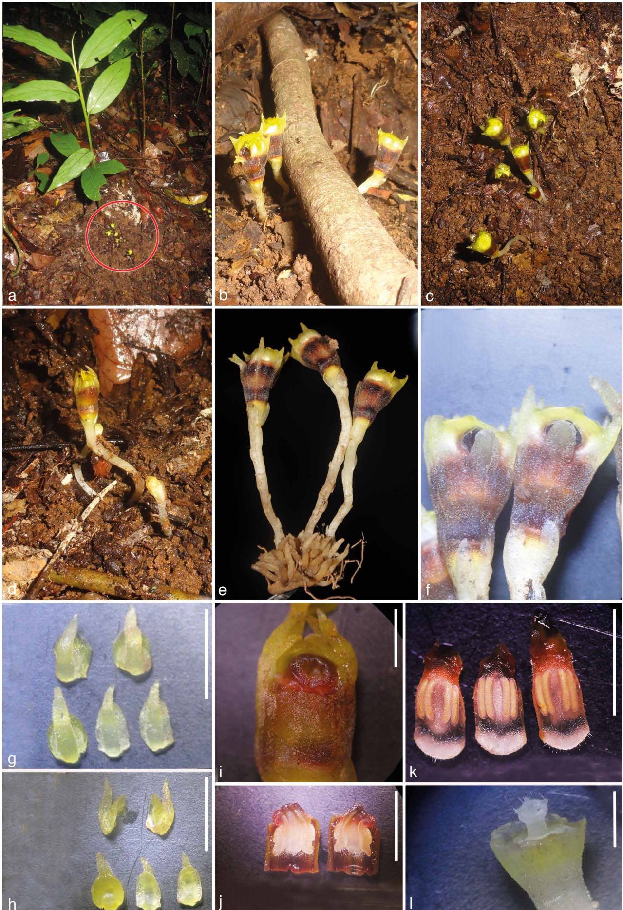
Fig. 2 Thismia sahyadrica Sujanapal, Robi & Dantas. a. Habitat; b–c. habit; d. young flowers; e. plants with flowers; f. flowers enlarged with pedicel and bract; g. outer view of tepals; h. inner and lateral view of tepals; i. hypanthium with lateral opening; j. longitudinal section of hypanthium together with annulus and stamen tube; k. stamens with connective; l. gynoecium with short style and papillose stigma. — Scale bars: g–h, j = 5 mm; i = 1 cm; k = 3 mm; l = 2 mm.