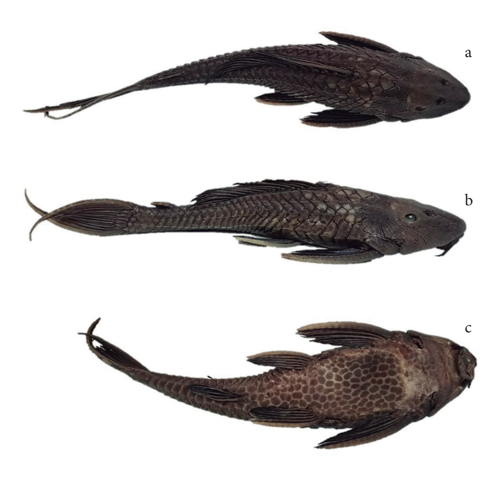
Figure 1. Adult specimen of Pterygoplichthys pardalis. a) dorsal, b) lateral, c) ventral view. Collected in Ozama River, Santo Domingo, Dominican Republic (MNHNSD-22.10556; 320.0 mm SL).

The examined specimens had a wide range in size (31.9–310.0 mm SL), including both juveniles and adult specimens. The selected morphometric and meristic measurements of the specimens are shown in Tables I and II. These measurements showed little variation with the ones reported for this species in previous studies (Wakida-Kusunoki & Amador del Angel, 2008; Chavez et al. , 2006; Wu et al. , 2011). These individuals had little variation in color but it was observed that juveniles had a brownish coloration while adult specimens are darker; ventral spots are more conspicuous in adults.