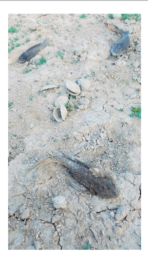
Figure 3. Carcasses of Pterygoplichthys pardalis in Cabral Lagoon, Barahona province, during runoff caused by drought.

Even though sightings of Pterygoplichthys specimens have been reported from all over the country in national media, the occurrence of more than one species is not ruled out. Since closer examination is needed to verify the identification as P. pardalis , just the ones examined in this study as well as observations made by the author and collaborators, when collection was not possible, are taken in consideration in the map of localities (Fig. 2).