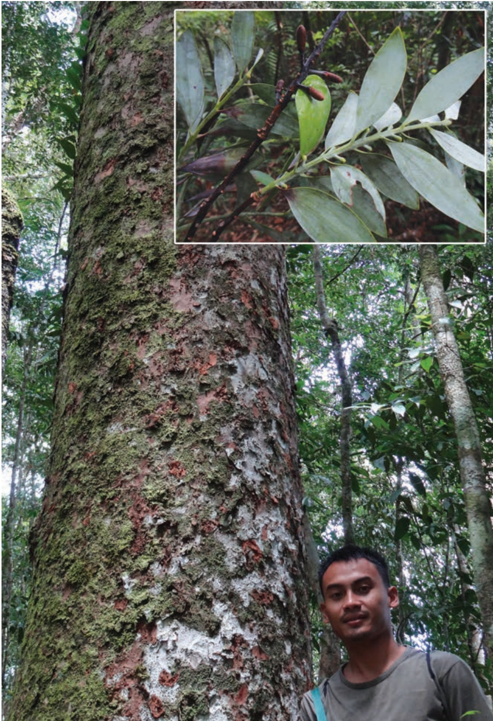
Fig. 2. Agathis lenticula de Laub. (Araucariaceae), the characteristic columnar bole with scaly-dimpled bark and (inset) glaucous leaves and male cones. Wong & Jangarun WKM 3303.