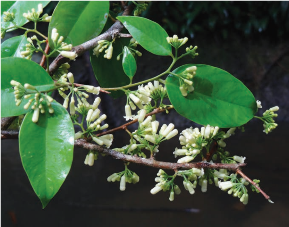
Fig. 6. Aquilaria microcarpa Baill. Flowering leafy branch. Lee et al. SL 974.

Provisional IUCN conservation assessment. Least Concern (LC) (IUCN, 2001) for Brunei as the species is reasonably well collected with populations existing in the Ulu Temburong National Park, and other Forest Reserves and conservation areas, where logging is not permitted.