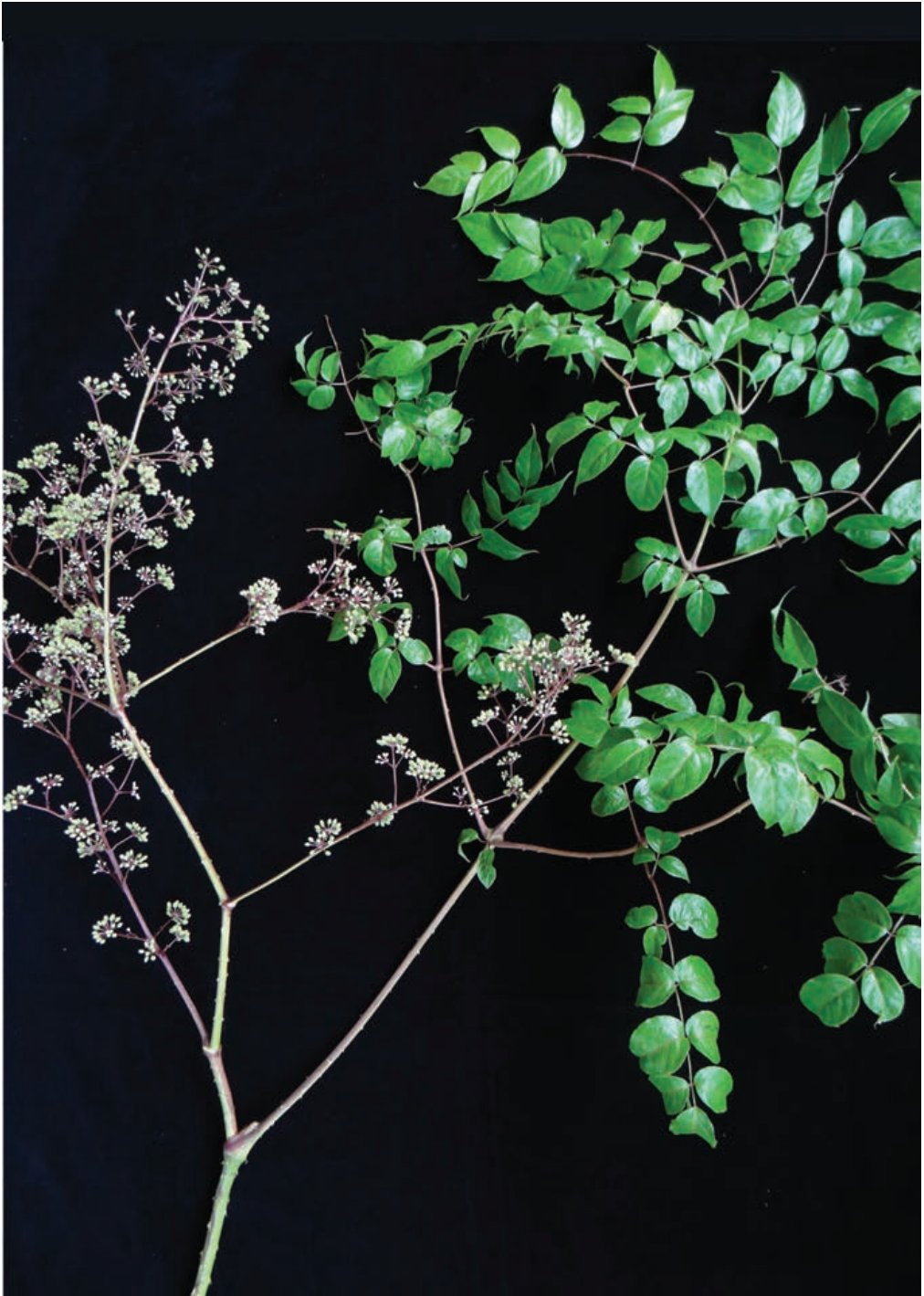
Fig. 1. Aralia merrillii C.B.Shang (Araliaceae), Wong & Jangarun WKM 3363.