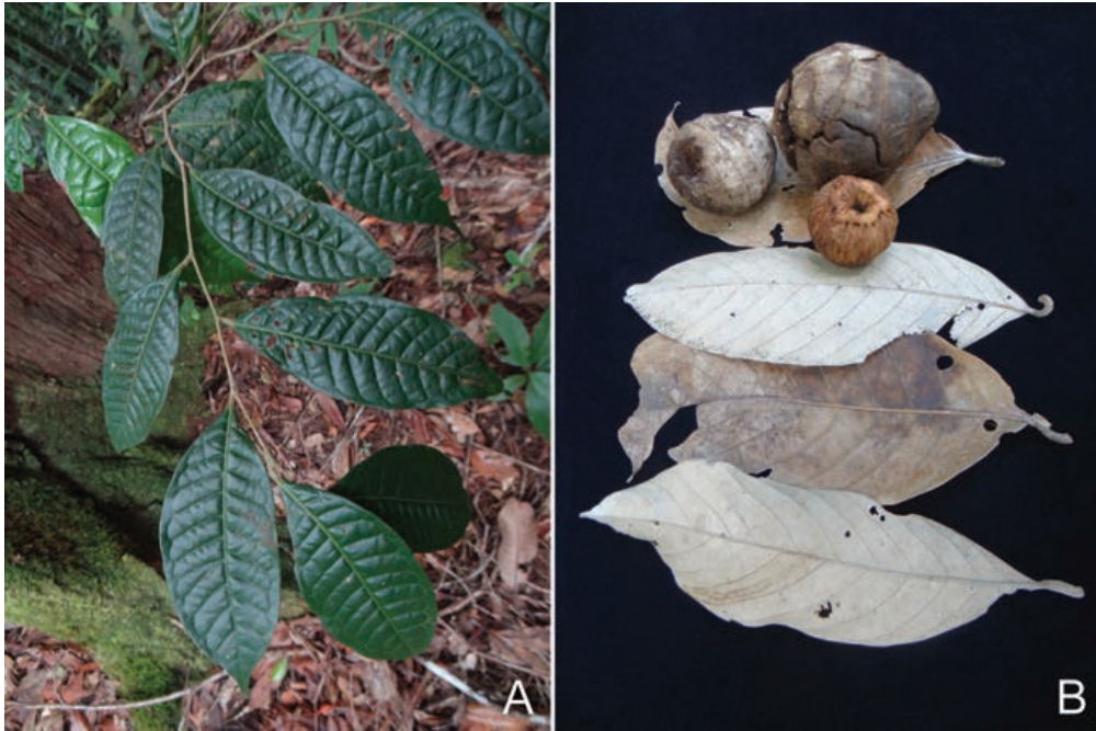
Fig. 4. New Lithocarpus records. A. Lithocarpus bullatus Hatus. ex Soepadmo. Wong WKM 3323. B. Lithocarpus hallieri (Seemen) A.Camus. Wong & Jangarun WKM 3295.

been recorded for the Mulu National Park (Sarawak), in Kalimantan (Indonesian Borneo), as well as on ultramafic soil in Beluran (Sabah) (Soepadmo et al., 2000). In Brunei, it is locally common in the hills around 1000 m in southern Temburong. The strongly bullate leaves are highly distinctive and no other Lithocarpus species approaches in this character.