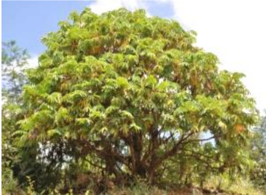
Figure 3. Hagenia abyssinica (Bruce) J.F. Gmelin.

infestation. Assefa et al. (2010) improve this as according to study in different parts of Ethiopia the flower parts used to treat Intestinal worms (tapeworm). According to the respondents it is widely used for treatments of tape worm and furniture making.