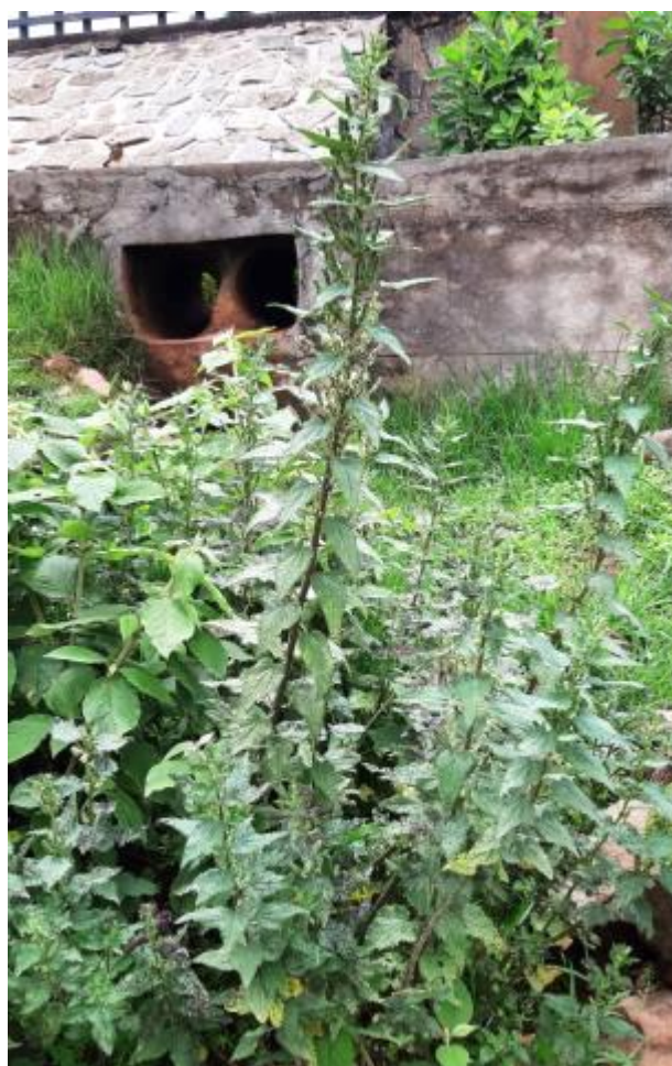
Figure 6. Urtica simensis Hochst. ex A. Rich.