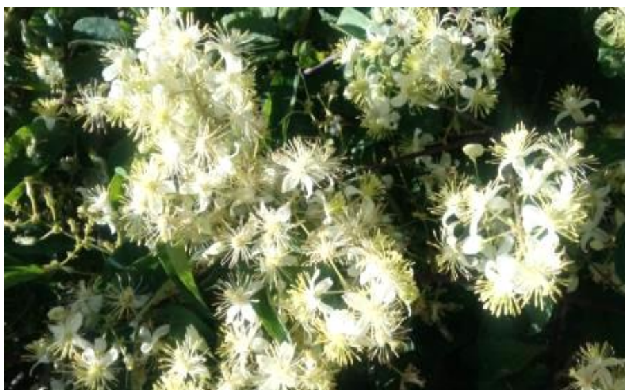
Figure 2. Clematis simensis Fresen.

The very acid juice has been recorded as being used for making tattoos, and possibly also for engraving iron. The leaves are used to dress wounds and the sap as a febrifuge and against bloat in animals. The findings of Abiyu et al. (2014) also indicate that Fresh leaf crushed with water, filtered juice is given orally for treatment of tonsillitis. The seeds are used against rheumatic pain. The over dosage application on the wound have side effects by increasing of its size.