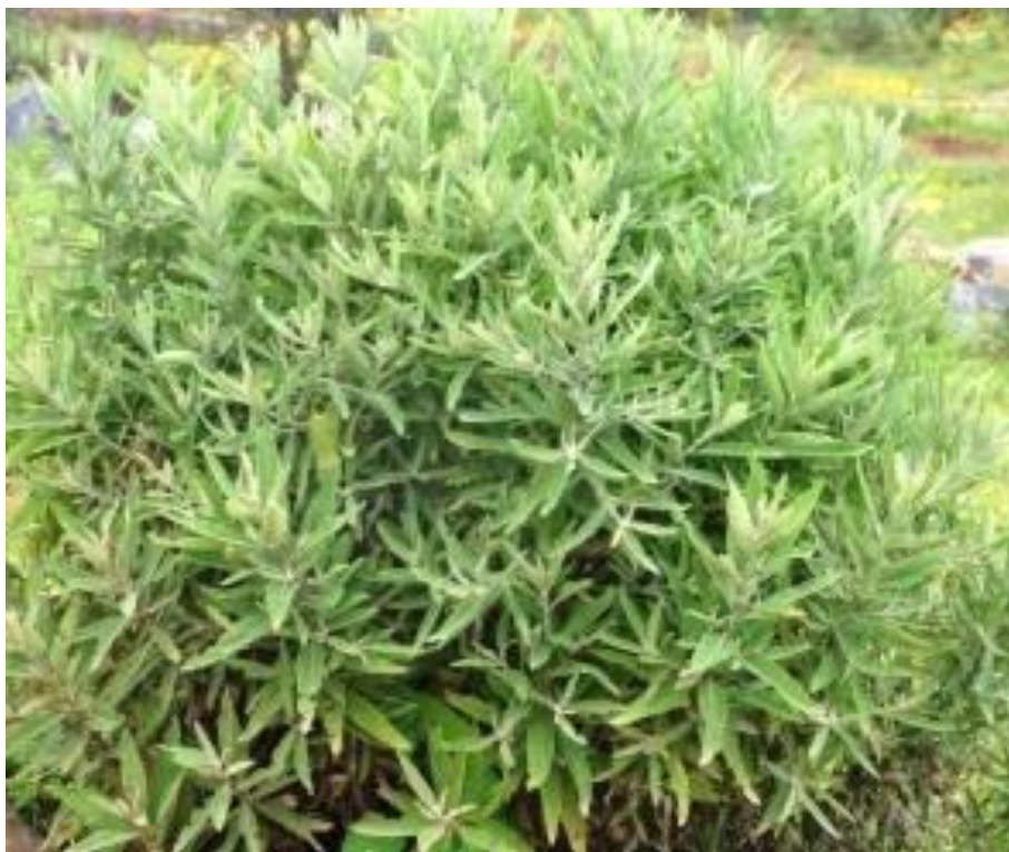
Figure 4. Laggera tomentosa (Sch. Bip. ex A. Rich.) Oliv. & Hiern.

Laggera tomentosa is a well-known and frequently cultivated medicinal plant. It is used as a fumigant and in cleaning milk containers. It is also used for the home cleaning. Used as the treatments of tonsil especially for children in the rural areas culturally. The result of Abiyu et al. (2014) opposes the present finding in which fresh leaf paste is used for alimnet of headache.