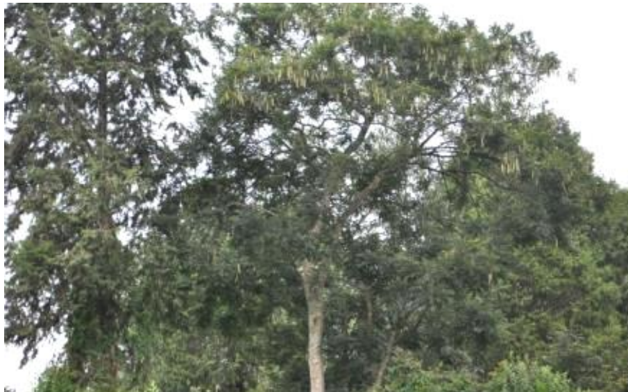
Figure 5. Milletia ferruginea (Hochst.) Bak.

The seeds contain a narcotic and the flour from them is used to stun fish. According to this study the moist fruit is used for fish harvesting which is not good for reproduction of fish due to the damage under age fishes.