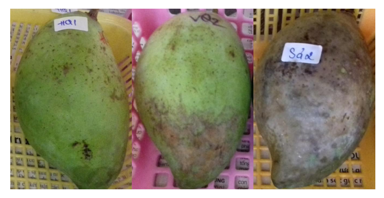
Figure 4. Effect of EOs on the peels of Cat Hoa Loc mango fruits. From left to right: basil, cinnamon, and lemongrass treatment.

Three EOs, namely, cinnamon, basil, and lemongrass oil, were selected to evaluate their effect on mango fruit peels. MIC of EOs was used in this study: cinnamon (1.6 \mu L/mL), basil (4 \mu L/mL), and lemongrass (12 \mu L/mL). Mango fruits of Cat Hoa Loc variety were dipped into EOs solution containing 5% DMSO and left to air-dry. Fruit peels were observed after 4 h of treatment. The results are presented in Figure 4. Lemongrass treatments showed heavily damaged fruit peel because its tested concentration was too high at up to 12 \mu L/mL. However, cinnamon oil was tested at a very low concentration (1.6 \mu L/mL), and it still induced an adverse effect on mango fruit peel. The finding may indicate that mango fruits of Cat Hoa Loc variety are sensitive to cinnamon bark. Basil treatment had a negligible effect on fruit peel, even though it was tested at quite a high concentration of 4 \mu L/mL. Cinnamon and lemongrass oil may be effective in controlling anthracnose disease, but they severely affect sensory value of mango fruits. Therefore, only basil oil was selected for the subsequent in vivo study.