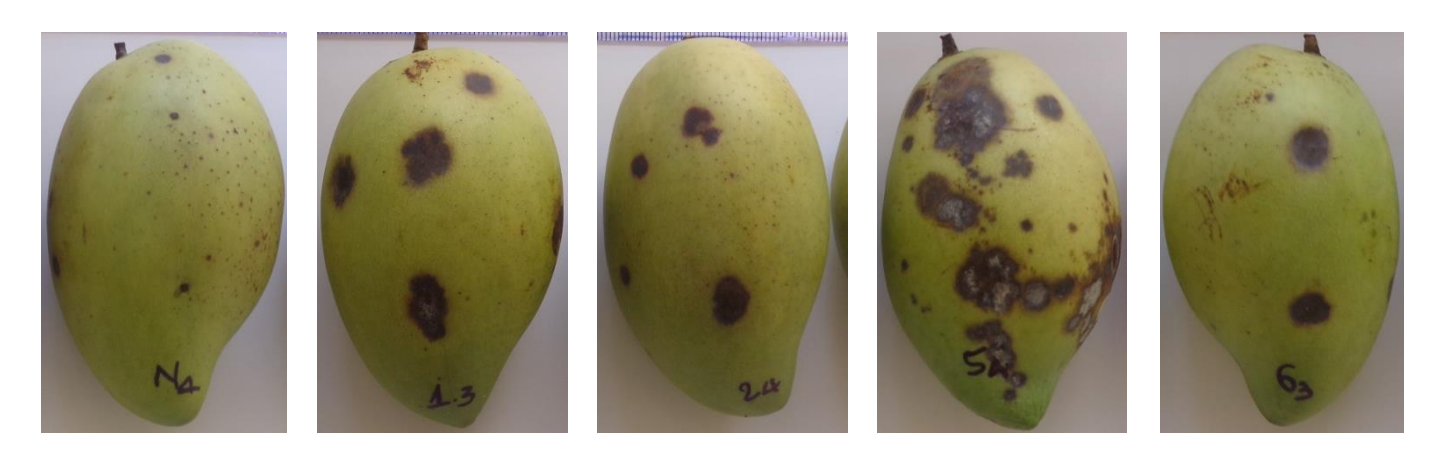
Figure 1. Anthracnose symptoms on Cat Hoa Loc mango fruits artificially infected by sterile distilled water, Col 1, Col 2, Col 5, and Col 6 strains (from left to right ) at 15 days after artificial infection.

Note: D.A.I., days after artificial infection. DW, distilled water. Numbers followed by the different letters in the same column were significantly different at 5% significance level by using Duncan's test.