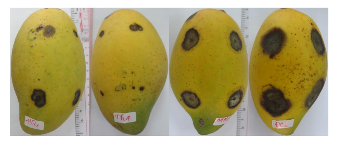
Figure 5. Anthracnose lesion on mango fruits of Cat Hoa Loc variety under effect of different treatments at 7 D.A.I. From left to right: basil EOs, fungicide, DMSO, and distilled water treatment.

Note: D.A.I., days after inoculation. Numbers followed by the different letters showed the significant difference at 5% significance level by using Duncan's test.