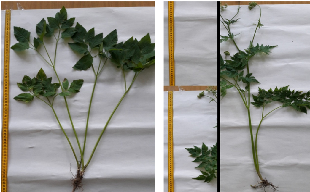
Figure 1. Aegopodium alpestre Ledeb

Aegopodium alpestre Ledeb. is a perennial grassy plant, growing to a height of 69.13 \pm 14.8 cm with rhizomes. The stem is hollow, furrowed, simple or slightly branching at the top. Both sides of the leaves are glabrous. Lower leaves are petiolate (attached to the stem by a petiole), and upper leaves are sessile (attached directly to the stem, lacking a petiole). The plates of lower leaves in the outline are broadly triangular, almost threefold; segments of its pinnate are dissected into ovate, pointed, incised-dentate lobes, about 3 cm long. The upper leaves have the lobes lanceolate and sharp. A compound umbel has 15 to 20 rays (floral branches), without involucre and involucels. These rays are angular, and the outer rays are much longer than the inner ones. The flower petals are 1 mm long, without clear tubules (Figure 1).