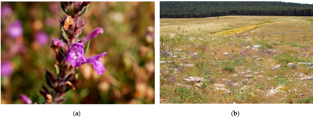
Figure 2. Clinopodium suaveolens (Sm.) Kuntze: (a) in flowering; (b) in its habitat, Acinos suaveolentis-Stipetum austroitalicae association.

Recently, some Satureja L., Micromeria Benthams, section Pseudomelissa Benthams species and all species of Calamintha Miller and Acinos Miller were transferred to Clinopodium by several authors [31–36]. Thus, the number of species belonging to the genus Clinopodium has reached about 100. They are mostly distributed in the New World (both temperate and tropical) and temperate Eurasia, but there are a few in Africa, tropical Asia, and Indo-Malaysia [37].