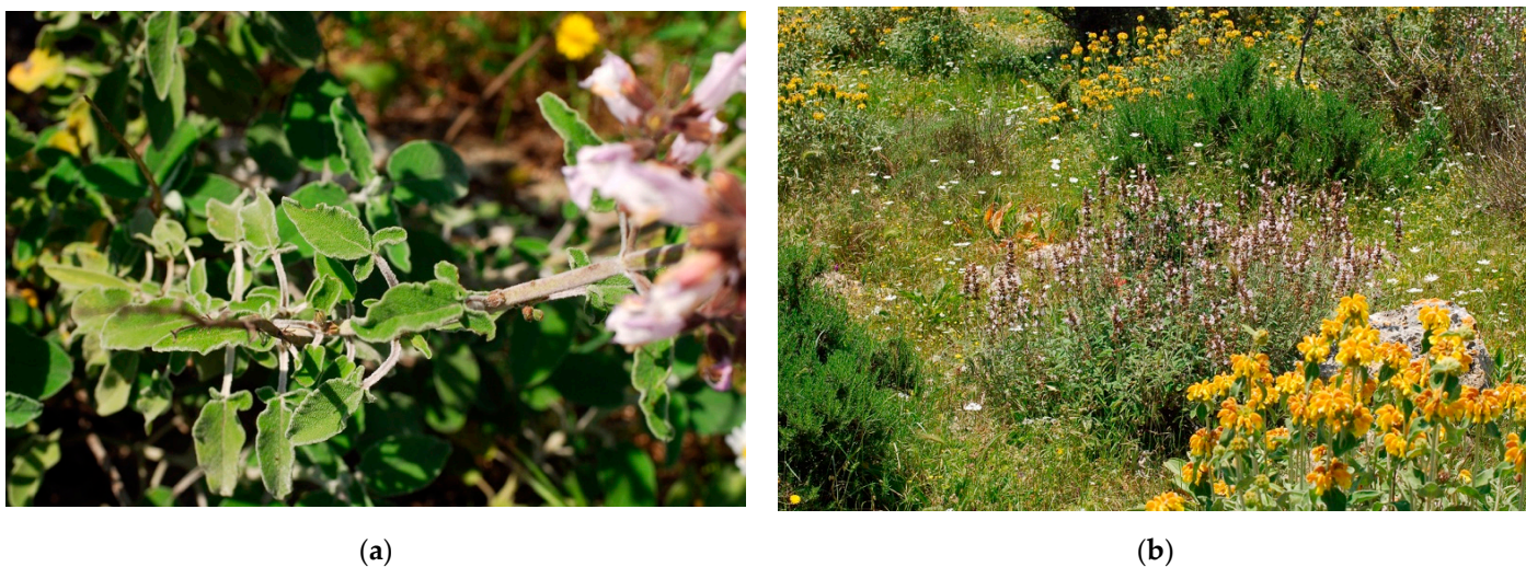
Figure 3. Salvia fruticosa Mill. subsp. thomasii (Lacaita) Brullo, Guglielmo, Pavone & Terrasi: (a) trilobe leaves; (b) in its habitat, Ruto chalepensis - Salvietum trilobae , Biondi & Guerra 2008.

Salvia fruticosa subsp. thomasii (synonym: Salvia thomasii Lacaita, S. triloba L.) is one of 1000 species belonging to the Salvia L. genus [52]. This perennial shrub is an endemic species located in some regions of the center–south of Italy [23]. In Apulia, the species has been detected in the central-eastern area of the “Gravine Arco Jonico” (Taranto), near Masseria Gaudella (Laterza) and in Gravina del Petruscio (Mottola). Other authors [18,53] observed that Gravina del Petruscio was the richest in individuals and presented a good capacity for renewal, while the population of a few individuals in Masseria Gaudella did not show a similar capacity. In all cases, there are doubts about the ability of this taxon to complete fruit ripening. The only available data are those related to the nominal species, whereas no scientific data related to the specific subspecies exist (Figure 3).