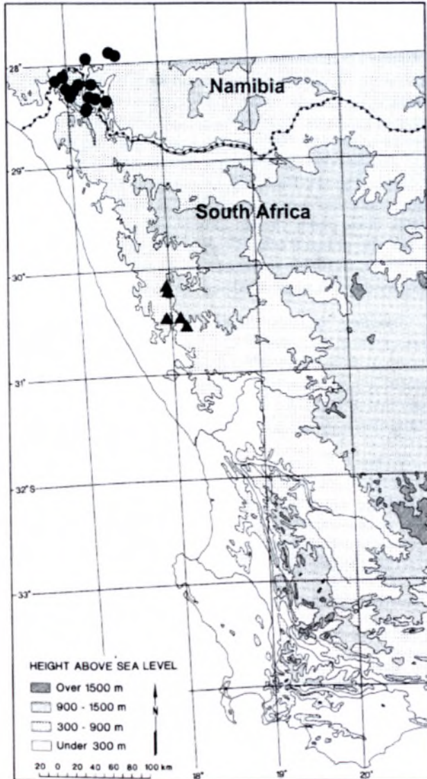
FIGURE 2.—Known distribution of Nemesia williamsonii , ●, and N. hemiptera , ▲, in southern Africa. Border between South Africa and Namibia is indicated by dotted line.

NORTHERN CAPE.—2816 (Oranjemund): top of Kodaspiek, (–BB), 20 Sept. 1981, Van Jaarsveld & Kritzing 6240 (NBG); 2817 (Violsdrif): Likkewaankloof, Richtersveld National Park, (–AA), 23 Aug. 1993, Zietsman 2350 (PRE); Abiekwarivier Mountain, (–AC), 20 Aug. 1987, Jurgens 22386 (PRE); Rosyntjieberg, close to base,