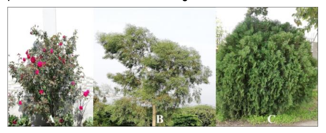
Figure 1: Indigenous trees and shrubs of Pakistan. A. Rosa indica (gulab), B. Eucalyptus regnans (safaida), C. Thuja standishii (mor pankh)

detoxification and its fruit is used as laxative. The leaves of Lonicera quinquelocularis (phut) are grinded into powder form then used for healing of wounds.<sup>17</sup>