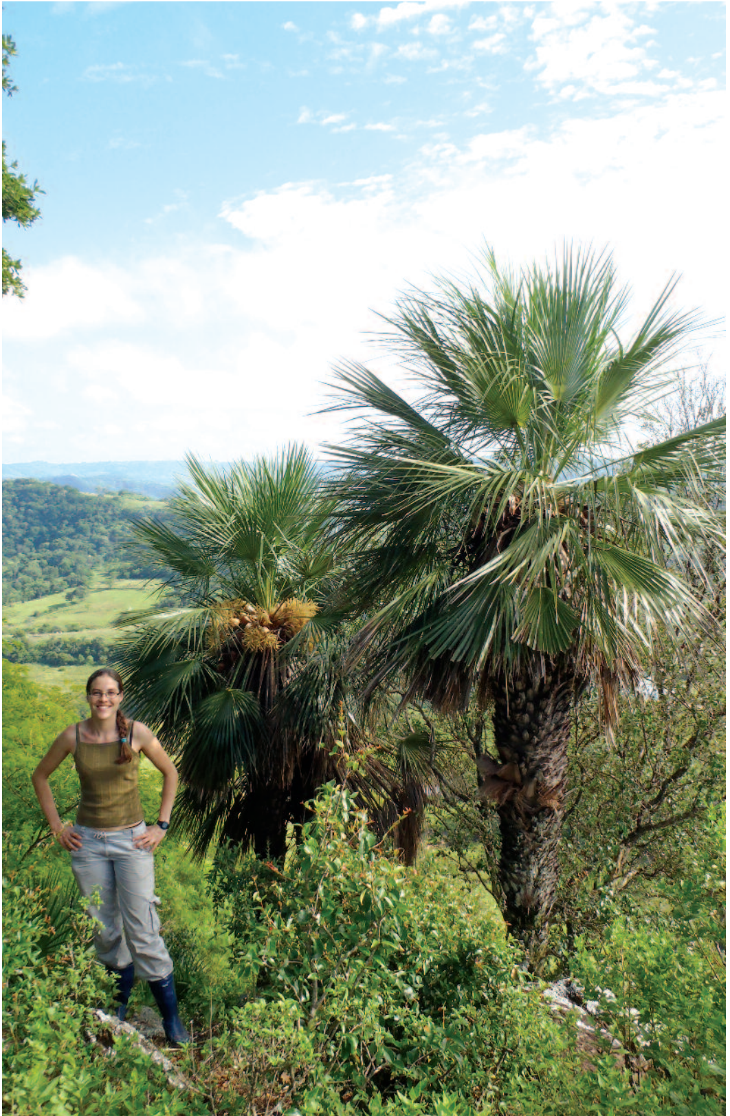
2. Trithrinax brasiliensis var. brasiliensis and the author, near Santa Maria, Rio Grande do Sul, Brazil.