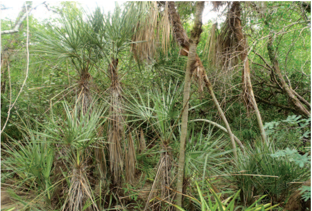
4 (top). Last wild individuals of Trithrinax brasiliensis var. acanthocoma in the Refugio Biológico Pikyry (Alto Paraná, Paraguay), surviving in a soya crop. 5 (bottom). Trithrinax schizophylla var. biflabellata in the private natural reserve Estancia Salazar, Presidente Hayes, Paraguay.

synonym of T. schizophylla ). I additionally noticed some similarities between the two palms; the leaves presented bifurcated laminas and the inflorescence and flowers showed