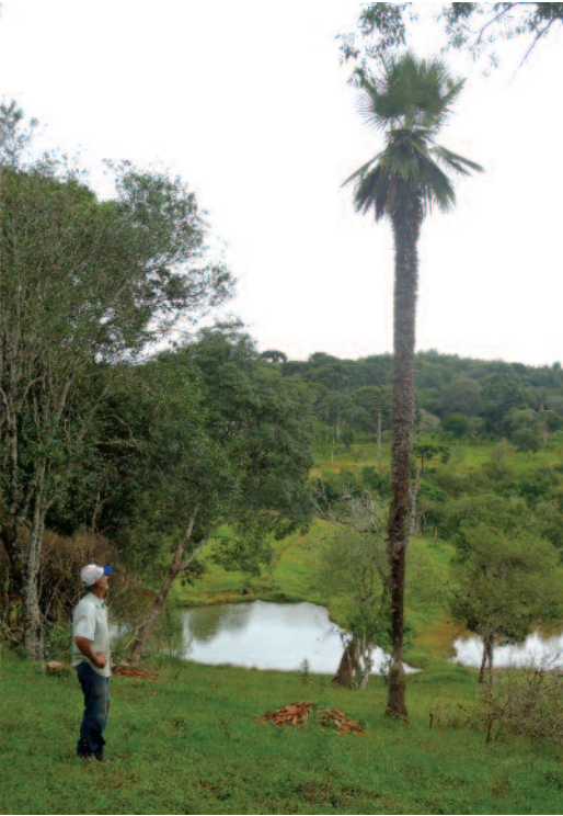
3. Trithrinax brasiliensis var. acanthocoma in Turvo, Paraná, Brazil. Note the cone of aerial roots.

shortly-bifurcated apices. I noticed also that although the vegetative organs of both taxa showed several remarkable differences, the inflorescences and the flowers were rather similar.