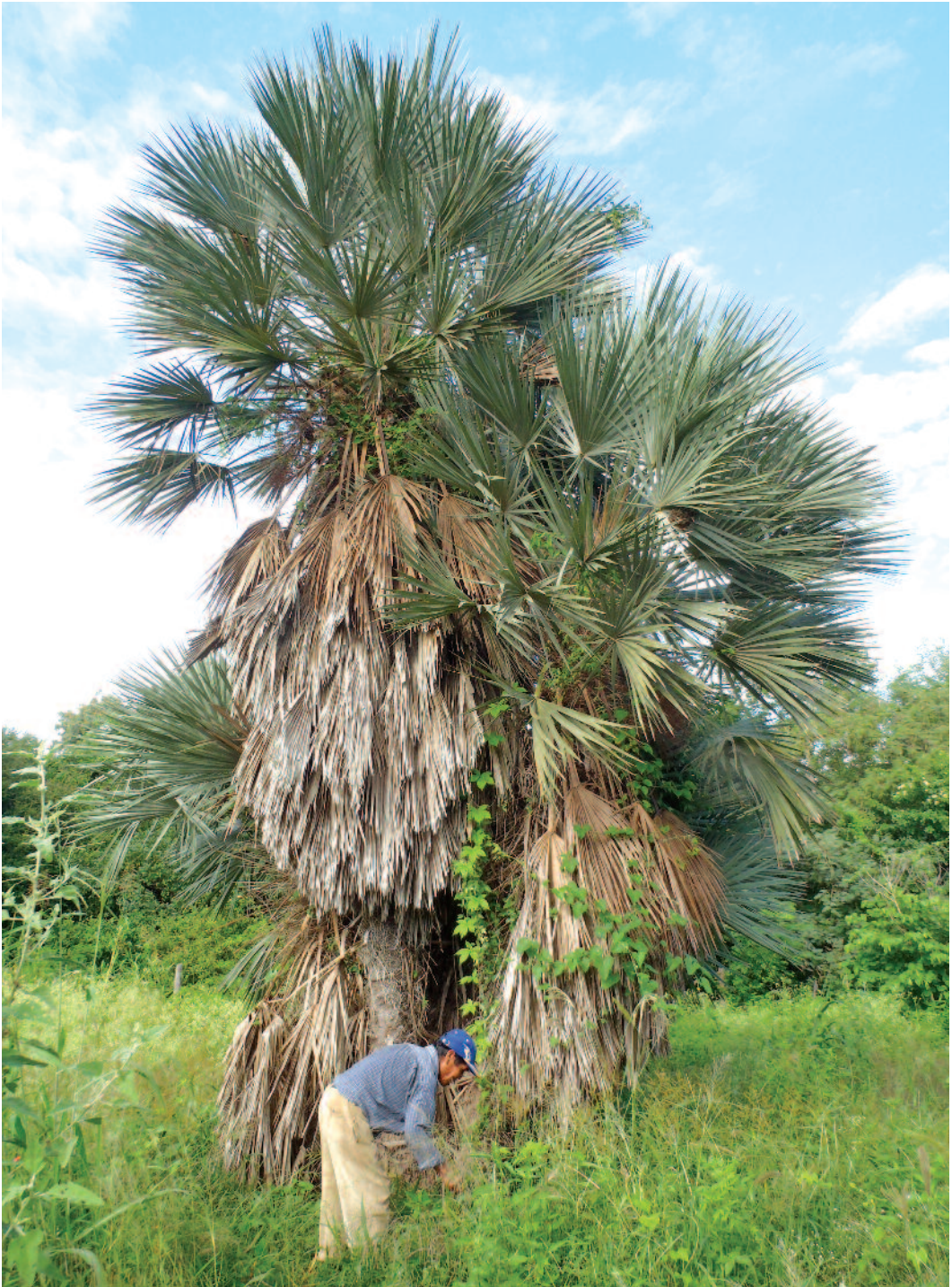
6. Trithrinax schizophylla var. schizophylla in Embarcación, Salta, Argentina.

My last target was Trithrinax campestris (Front Cover), and in order to visit wild populations I travelled south to Pozo Hondo (Santiago del Estero). I soon learned that this palm is a record maker within the genus; the leaf-blade is much harder and thicker than in the rest of