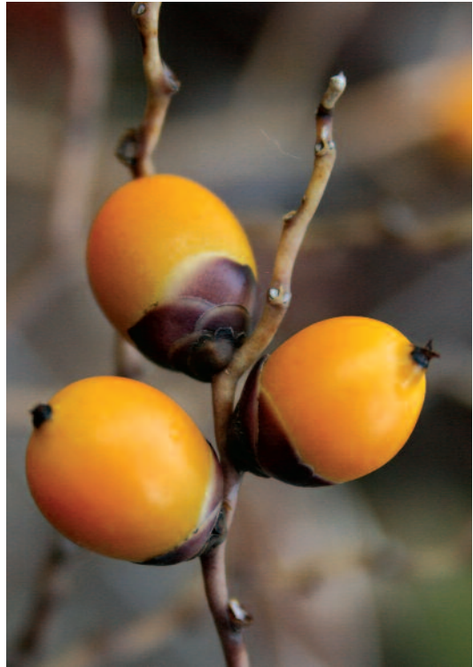
6 (left). Pistillate flowers Ptychosperma halmaherense after anthesis of. 7 (right). Ripe fruits of Ptychosperma halmaherense , showing color contrast between fruit, perianth and stigmatic remains.

known to exist at only a single location. Moreover, the population size is estimated to number fewer than 250 mature individuals.