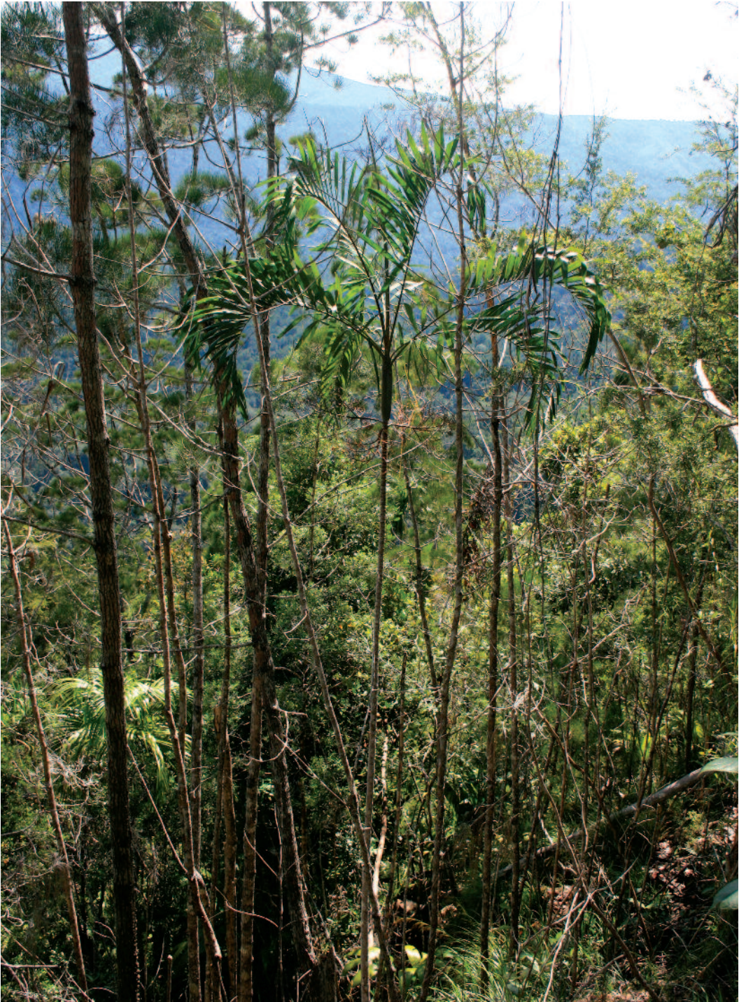
2. Ptychosperma halmaherense , showing slender and solitary habit and growing on steep terrain.

As part of an environment impact assessment undertaken in the Maba-Ferro Nickel Project, in Halmahera Timur, North Moluccas, I had the privilege to join the team as botanist to carry out the initial survey of biodiversity in the area. The initial survey took one week with