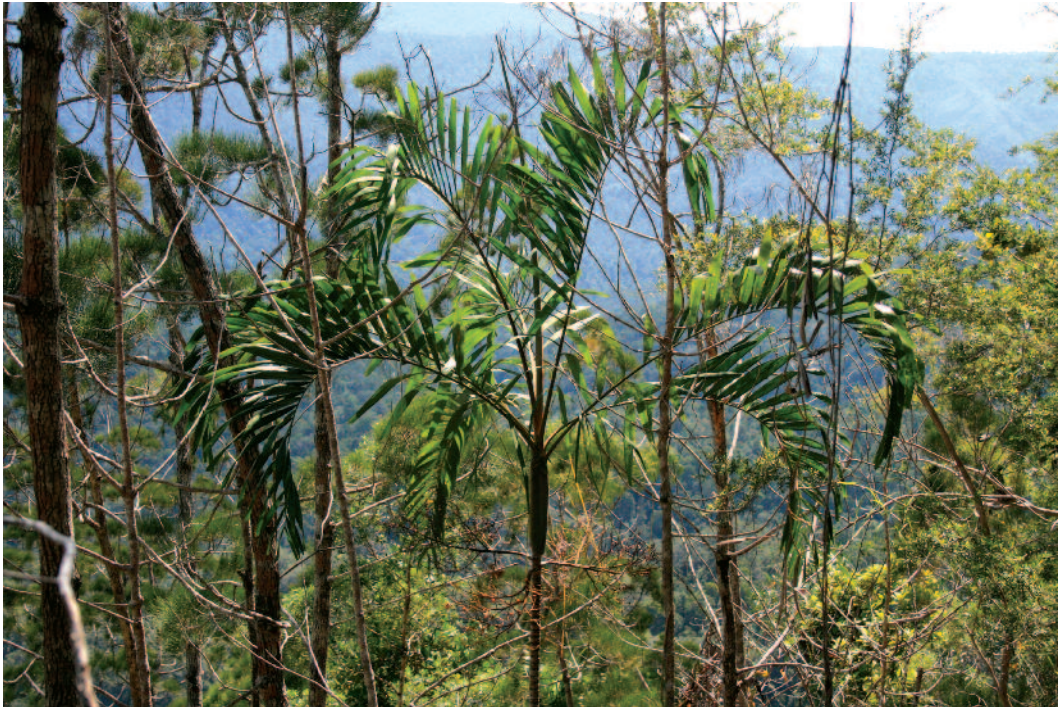
3. Crown of Ptychosperma halmaherense , showing beautiful strongly-arching leaves, the crownshaft and the inflorescences.

contribute to the development of the environmental management of the project, especially in support of the post-mining rehabilitation program. The main target was the heath forest developed on ultramafic soils, which will be most affected by the mining.