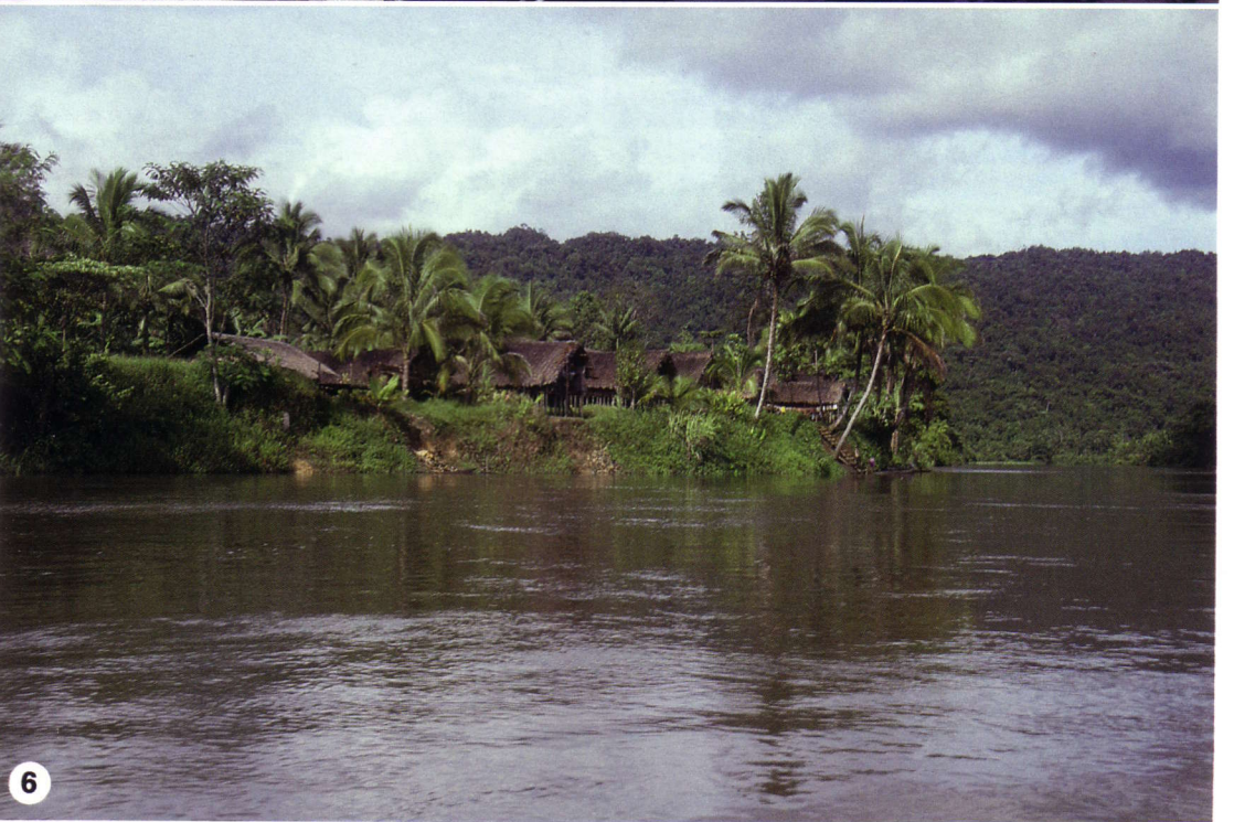
5. Heterospathe macgregorii : infructescence with ripe fruit. 6. The village of Kantobo.