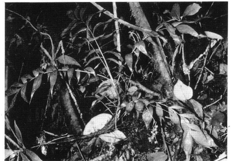
5. Fruiting plant of Chamaedorea fractiflexa in Quetzaltenango, Guatemala displaying procumbent stem.