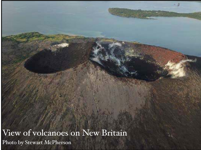
View of volcanoes on New Britain

Sunday November 3rd: Early morning flight to Port Moresby to connect to afternoon departing flights.