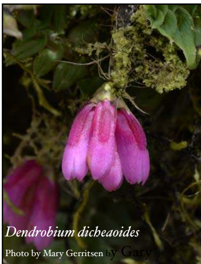
Dendrobium dichaeoides Photo by Mary Gerritsen by Gary

learn more about where the tourists come from etc. Those not wanting to come can have a relaxing morning at Magic Mountain. After lunch we will visit the Kumul Lodge in adjacent Enga province. Here there is a lovely balcony where one can watch many different species of birds (including parrots, honey eaters and birds of paradise) feeding on fruit and seeds. We will then take a walk through the forest (or we can drive) down to a local orchid farm. The orchids are