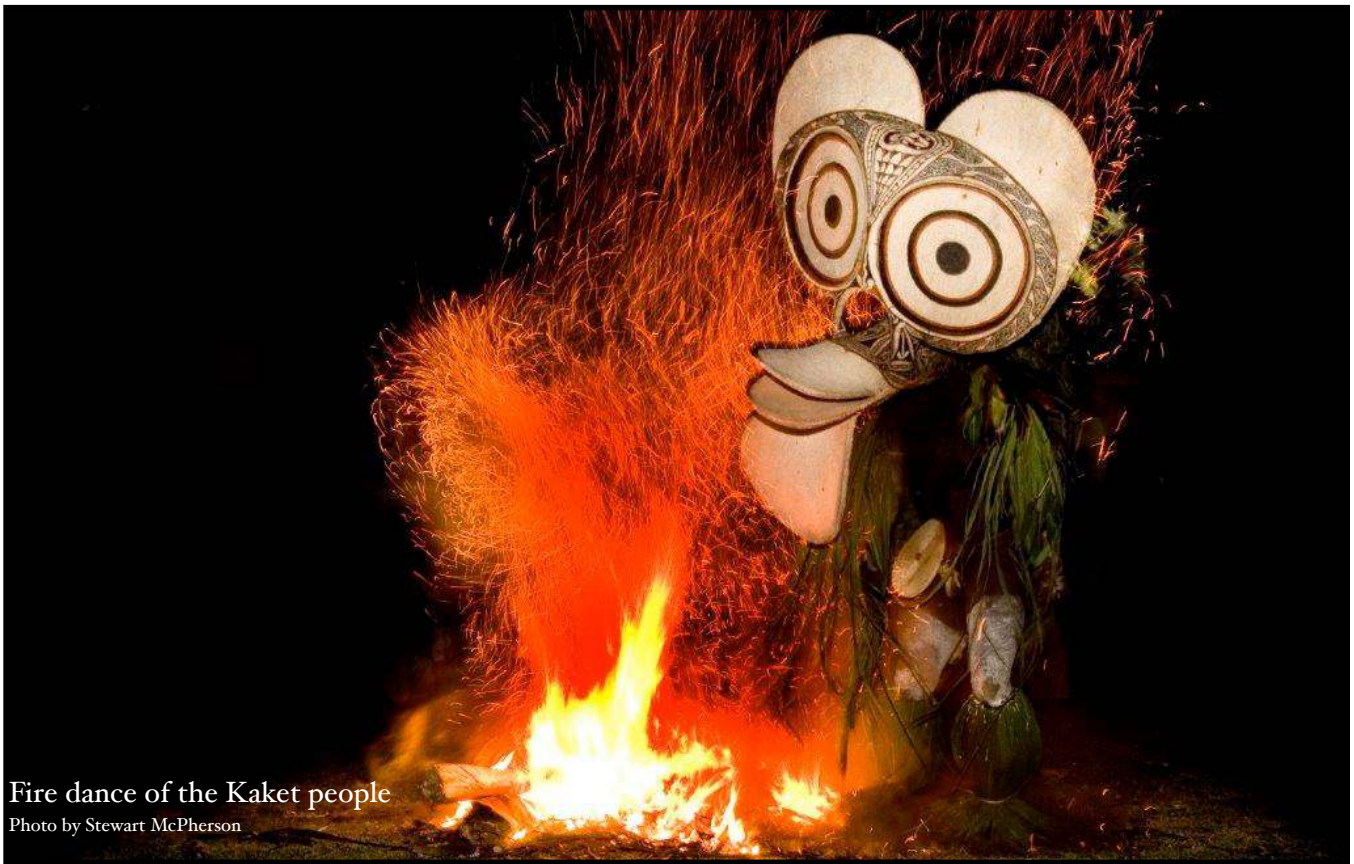
Fire dance of the Kaket people

Friday November 1st: We drive into the Baining Mountains to visit a village of the Kaket people. They invite us to take part in a traditional mumu feast (cooked on red-hot stones in an earth oven), and after dark, we witness their traditional fire dance (Baining men in large bark head-dresses jump through fire and sparks)! Dinner and overnight at Rabaul Hotel.