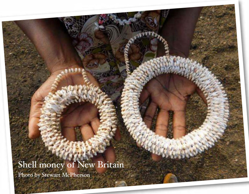
Shell money of New Britain