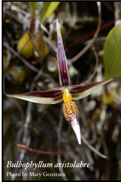
Bulbophyllum aristolabre