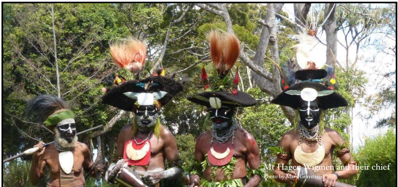
Mt Hagen Wigmen and their chief