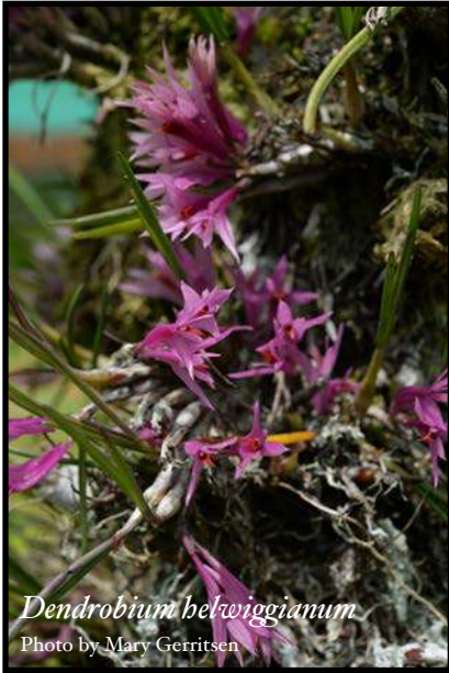
Dendrobium helwigianum