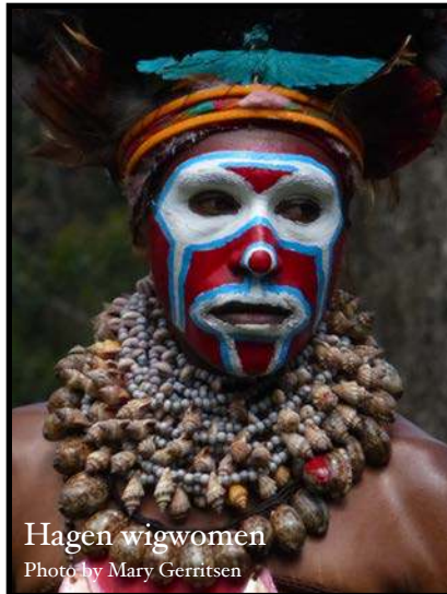
Hagen wigwomen