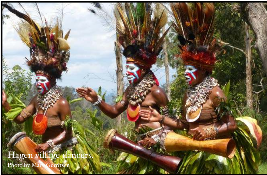
Hagen village dancers.