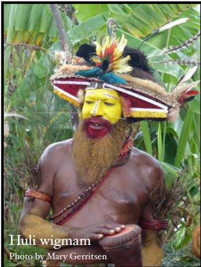
Huli wigman