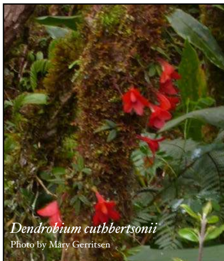
Dendrobium cutbertsonii