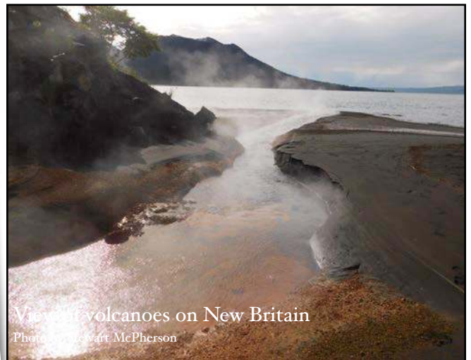
View of volcanoes on New Britain