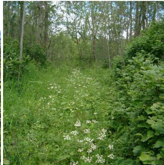
An existing part of the trail invaded by wild caraway