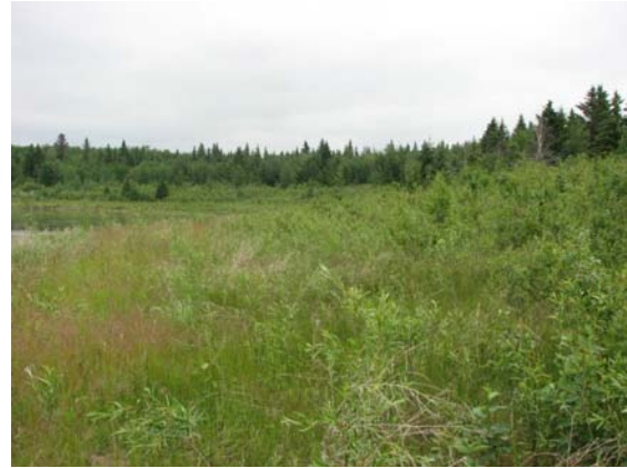
Proposed trail area along shoreline