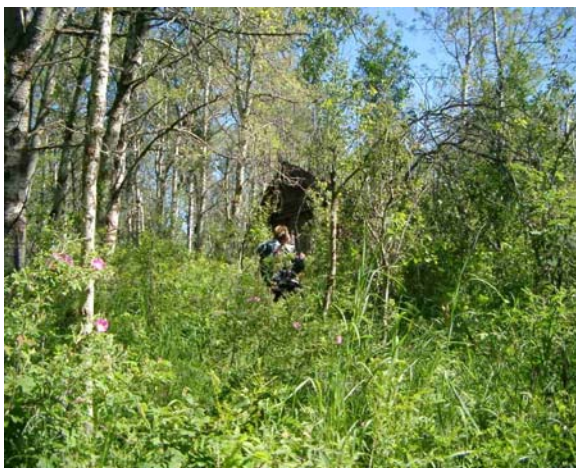
Approach to old cabin site