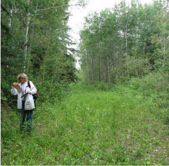
Collecting at AT AR1