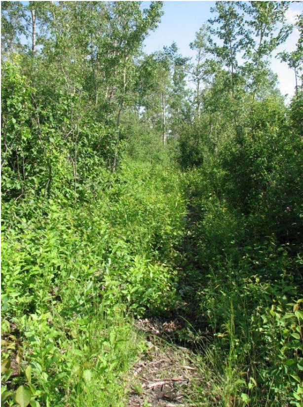
Existing trail between bench and future platform area