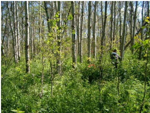
Mesic aspen forest on slope