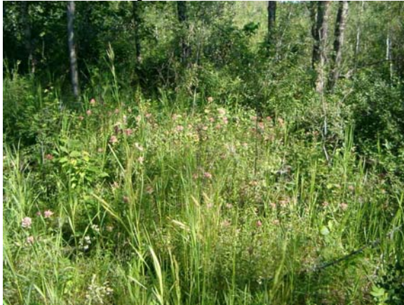
Paintbrush in open aspen forest