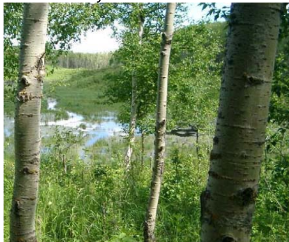
Overlooking beaver pond