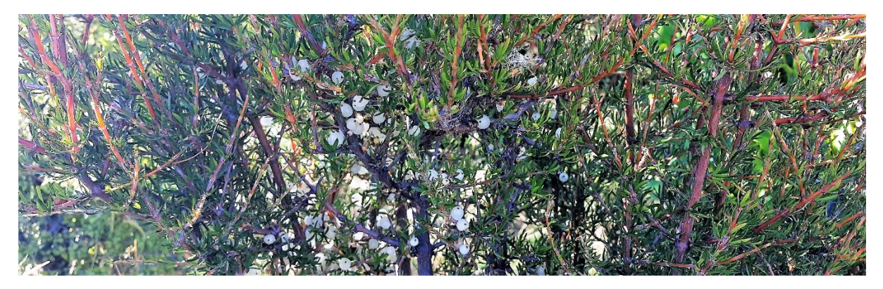
Berries on Coprosma rugosa

Try to buy plants from retailers who leave their plants out in the open and not under nursery canopies. This toughens the plants up more. It is often worth checking out the bargain bin because those plants that have been left to dry may look terrible but they can often cope well with dry Twizel/Lake Ohau conditions!