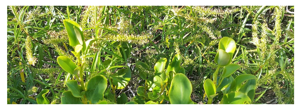
Broadleaf (Griselinia littoralis) and Hebe (Veronica sp)

With the dry environments at Twizel and Lake Ohau, try to keep a buffer around your house free of plants or plant less flammable species. This will help to create a defensible space around your house that allow heat and embers to dissipate if there is a fire. You can find out more information about the flammability of native plant species in this brochure prepared by NZ Fire Service - www.wrfd.org.nz/sites/default/files/Lowflamablespeciesbrochure.pdf