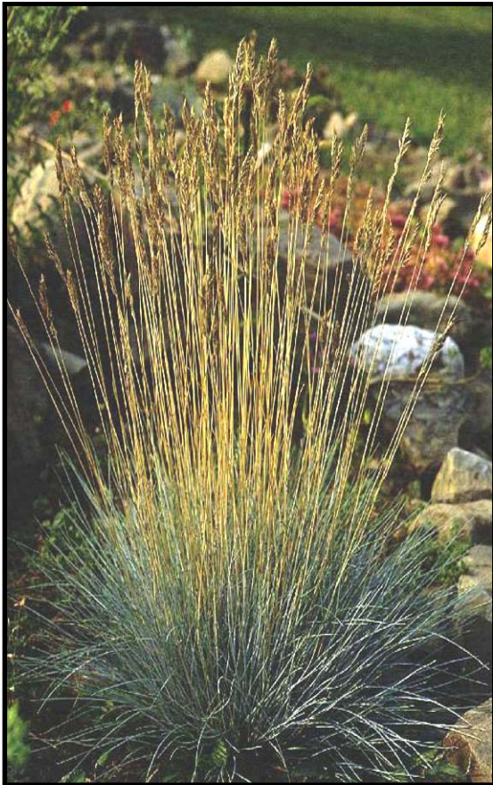
Figure 1. Sheep fescue in xeriscape garden.

Contributed By: USDA, NRCS, Idaho and Washington Plant Materials Staff and the National Plant Data Center