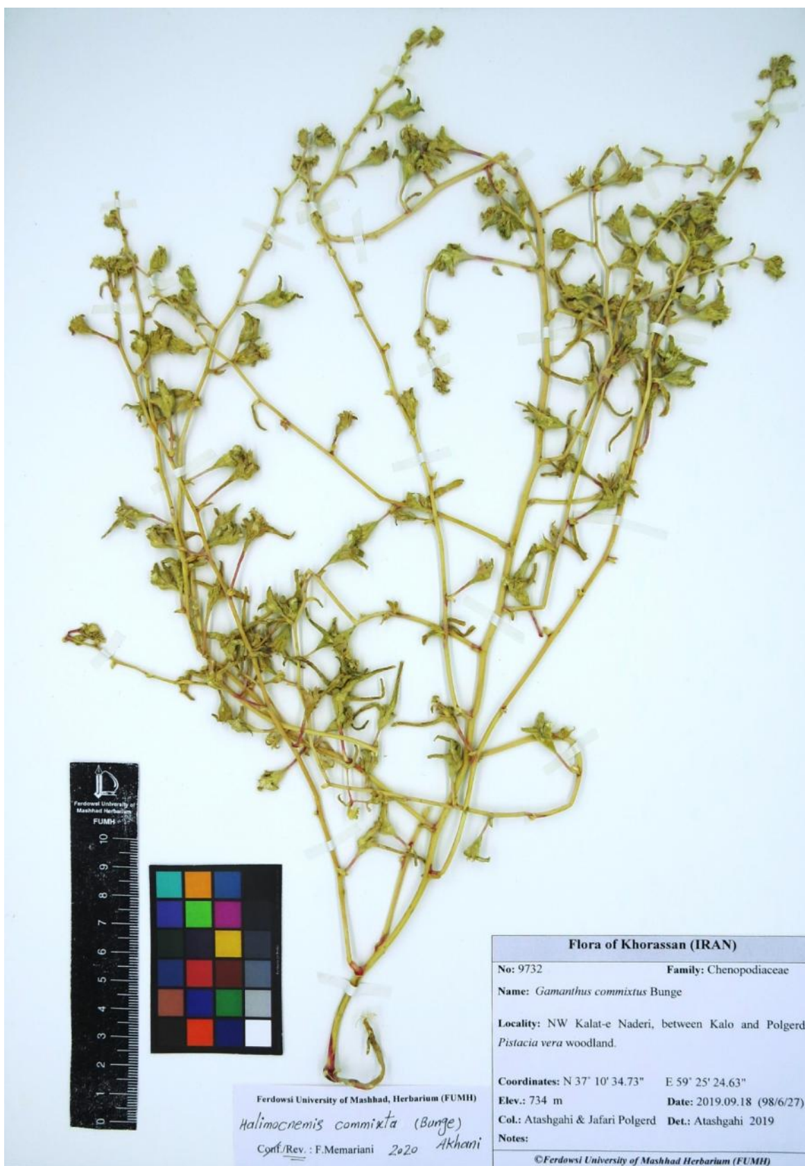
Figure 1. Herbarium specimen of Halimocnemis commixta (Atashgahi & Jafari Polgerd 9732-FUMH).