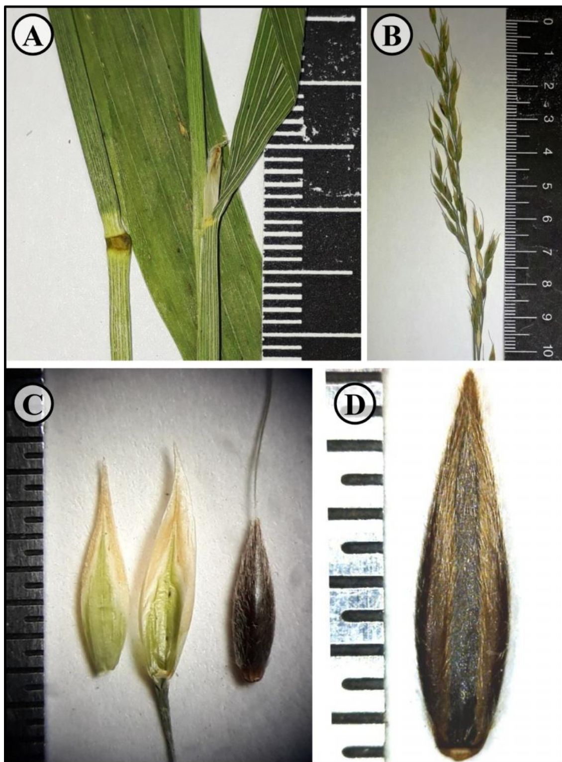
Figure 2. A-D: Some details of morphological characters in Piptatherum ferganense (Arjmandi 46790-FUMH); A: the leaf sheaths showing the long ligule (ca. 7 mm), culm node, and the wide leaf blade (ca. 10 mm); B: the lanceolate panicle with evenly furnished spikelets; C: the acuminate glumes and the antherium with hairy lanceolate lemma and a slightly curved awn; D: a ventral view of the antherium.