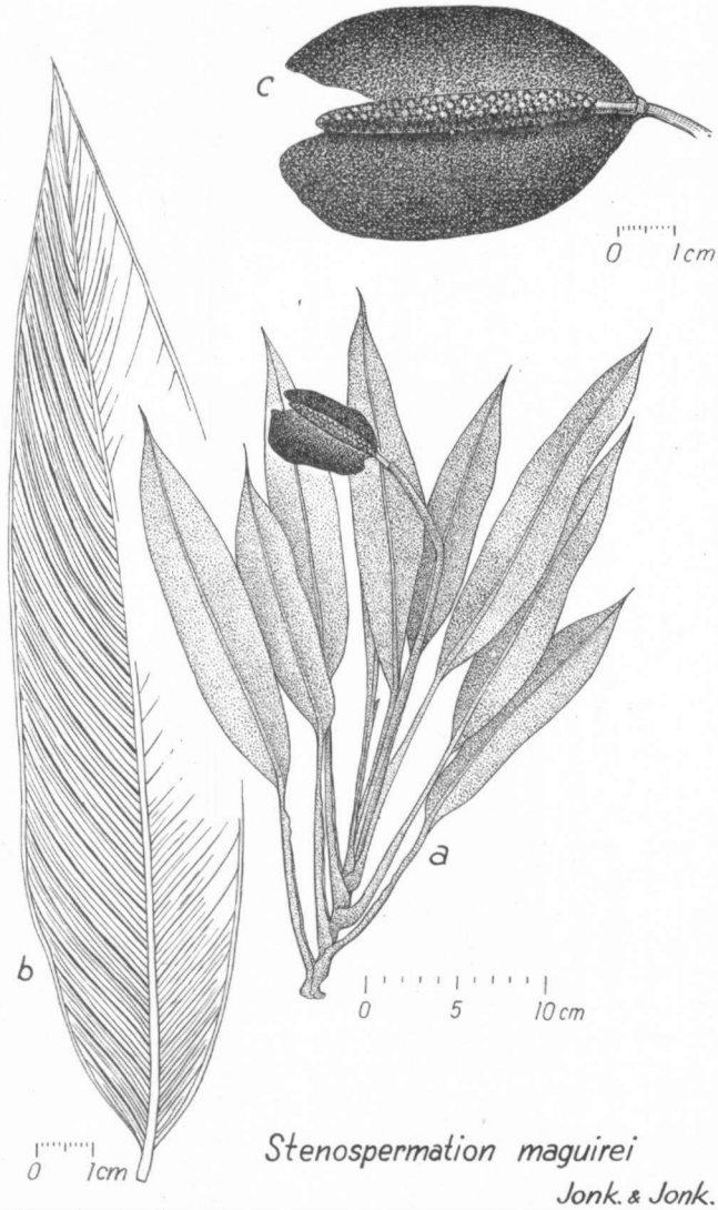
Fig. 1. a. flowering plant, b. leaf, c. spathe and spadix.

PULLE was not acquainted with the Suriname species of the genus Stenospermatium , but MAGUIRE collected two specimens, both named by HAWKES: Stenospermatium spruceanum Schott. A specimen collected in British Guiana was cited by him in the same paper as Rhodspatha