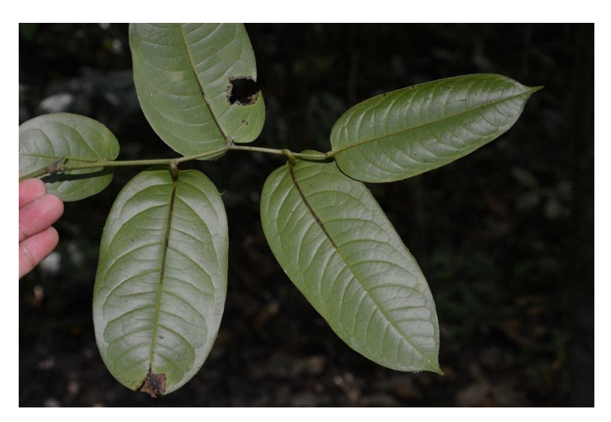
G. scandens

Small to medium sized trees, with a single species (G. scandens) known to be a scrambling liana at maturity. Stems woody, cylindrical up to 15 m in length and about 5 cm in diam.; cross section with numerous conspicuous rays and wide vessels; exudate slightly mucilaginous; inner bark fibrous. Leaves alternate, simple, entire, with impressed