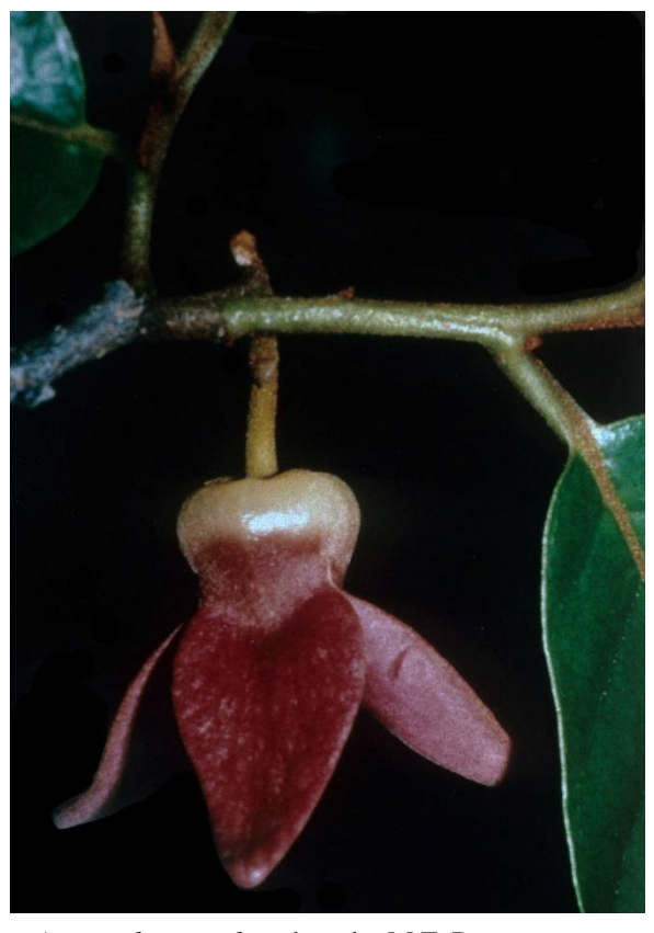
Annona haemantha, photo by M.F. Prevost

Largely a pantropical family of trees, shrubs or rarely lianas, with about 113 genera and 430 species. Lianas are found in about 7 genera which for the most part are comprised of species of trees or shrubs. In the Neotropics, the family is represented by 34 genera and about 886 species. Of these, only two genera (i.e., Annona and Guatteria ) contain a total of 10 species of vines. For the most part, climbing Annonaceae are found above in moist, or wet forest, in flooded or non-flooded habitats at low elevations.