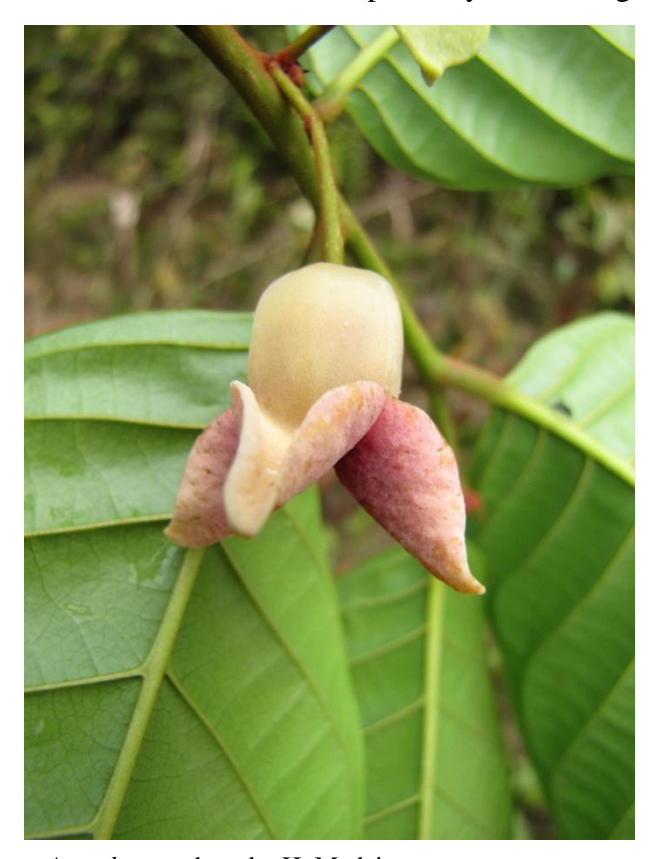
A. ambotay

Trees, shrubs or exceptionally scrambling shrubs; stems cylindrical, reaching 10-15 m