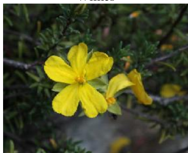
Hibbertia riparia