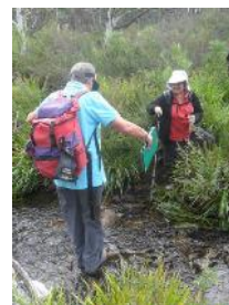
Crossing Wog Wog Creek Image by Victoria Tanner