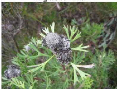
Isopogon anemonifolius