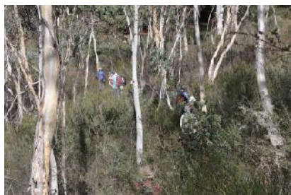
Descending to the creek

The Wog Wog camping area is off Charleys Forest Road, not far from the intersection with the Nerriga road. The walk descends through open woodland to Wog Wog Creek which we crossed then rises to a plateau where we found the banksias we were looking for. There were many Banksia spinulosa and B. paludosa – from buds through to full flowers in an array of colours. We also found one B. marginata in flower. There was the odd pea flowering - Mirbelia platylobioides , Bossiaea prostrata - one Dampiera stricta flower, quite a lot of Epacris microphylla with flowers, Goodenia hederacea ssp. alpestris , Hibbertia riparia , Mitrasacme polymorpha and Comesperma sphaerocarpum . Other interesting plants were Patersonia sericea , P. longifolia , Gompholobium minus (and another one which we couldn't ID), Chloanthes stoechadis , Petrophile sessilis , Isopogon anemonifolius , I. anethifolius , Hakea laevipes , H. microcarpa , H. sericea and Pomaderris phyllicifolia ssp. ericoides . Some of us had a quick foray across the road in another area of Morton National Park to see if it warranted a separate visit - probably. On our way home we stopped for the nice stand of Eucalyptus moorei on the roadside.