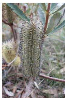
Banksia paludosa