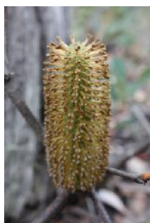
Banksia paludosa