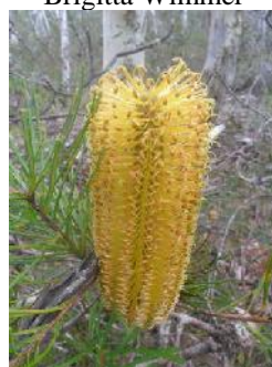
Banksia spinulosa