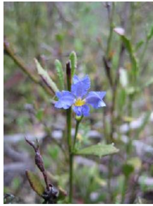
Dampiera stricta