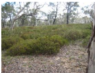
Allocasuarina nana heath