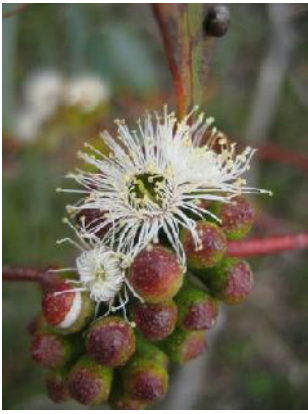
Eucalyptus pauciflora Image by Brigitta Wimmer