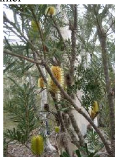
Banksia marginata Image by Brigitta Wimmer