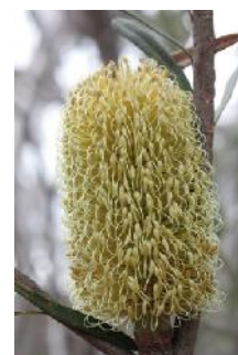
Banksia marginata