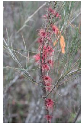
Allocasuarina nana