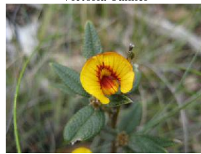
Mirbelia platylobioides