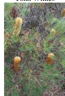
Banksia spinulosa