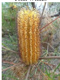
Banksia spinulosa Image by Victoria Tanner