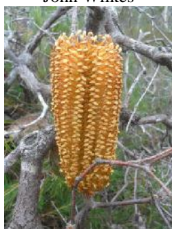
Banksia spinulosa Image by Victoria Tanner