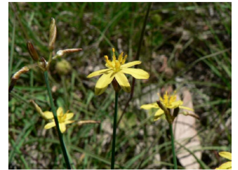
Tricoryne elatior Image by Roger Farrow