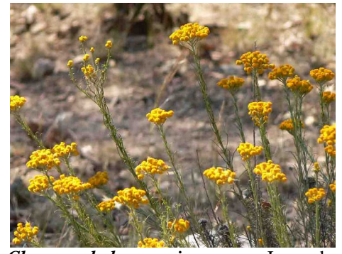
Chrysocephalum semipapposum