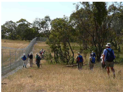
Outside the Sanctuary fence

The walk started from the park entrance on Amy Ackman Street, Forde. After walking up the Old Coach Road entry, we explored some of the grassland to the north but did not enter the Sanctuary Enclosure. We found a good array of grasses and grassland plants including Caesia calliantha which we have not seen at Mulligan's Flat before. There were lots of Dichopogon fimbriatus in flower. We then headed south to the bottom end of the reserve which is now surrounded by suburbs. It became hot very quickly so only covered a small area but found some interesting plants including Cullen microcephalum , Xerochrysum viscosum , Cassinia hewsonia , Goodenia pinnatifida , Lotus australis – all flowering or in bud. On our return, there were good displays of Tricoryne elatior and the C. calliantha flowers were open. We also found 3 shinglebacks and a Chough's nest, in a big old Eucalyptus melliodora .