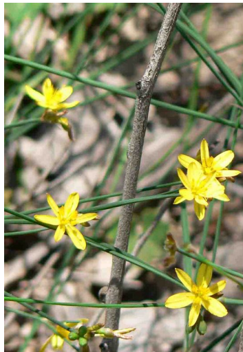
Tricoryne elatior