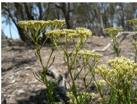
Cassinia hewsoniae