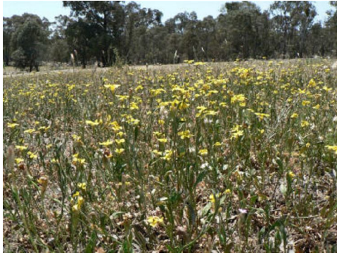
Goodenia pinnatifida