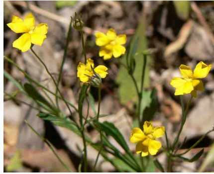
Goodenia pinnatifida