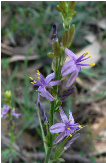
Caesia calliantha