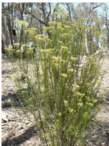
Cassinia hewsoniae