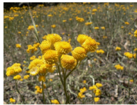
Chrysocephalum apiculatum