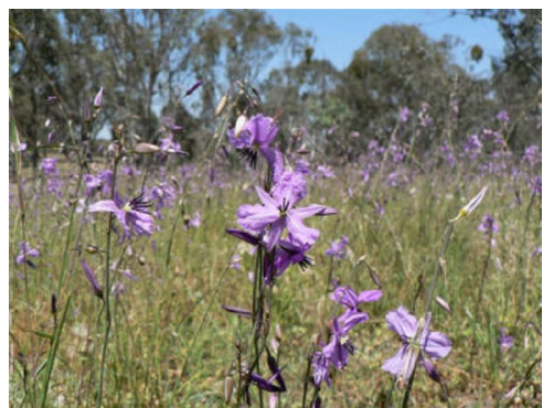
Dichopogon fimbriatus