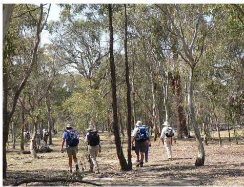
Open woodland in southern end