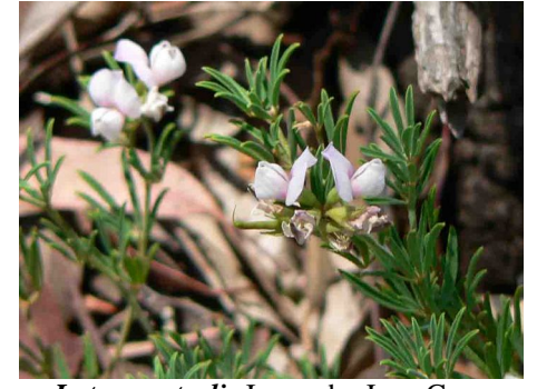
Lotus australis