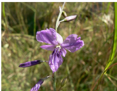
Dichopogon fimbriatus Image by Roger Farrow