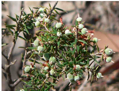
Young seed of Lissanthe strigosa