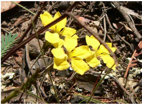
Goodenia hederacea