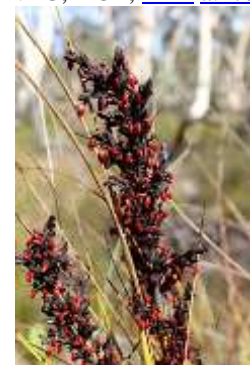
Gahnia subaequiglumis Fagg, M. 2018, Nadgigomar Nature Reserve, along Silvertop Ash Trail, about 1.3 km W of Mogo Road, NSW, APII dig.50754