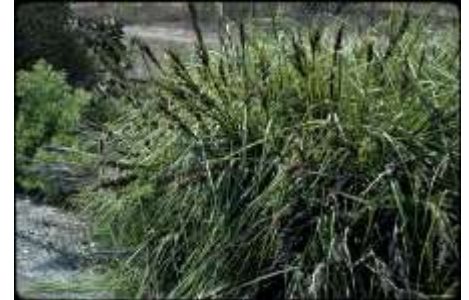
Gahnia melanocarpa Hotchkiss, R, ANBG, 1991, APII a.6491