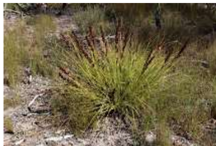
Gahnia subaequiglumis Fagg, M. 2018, Nadgigomar Nature Reserve, along Silvertop Ash Trail, about 1.3 km W of Mogo Road, NSW, APII dig.50753