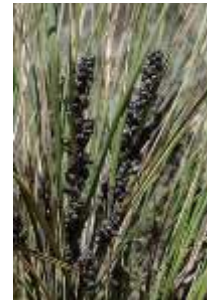
Gahnia aspera, ~10 km SW of Araluen, NSW, APII dig.8522