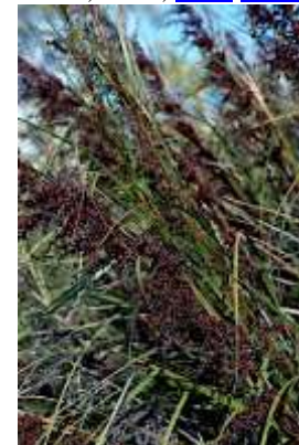
Gahnia sieberiana