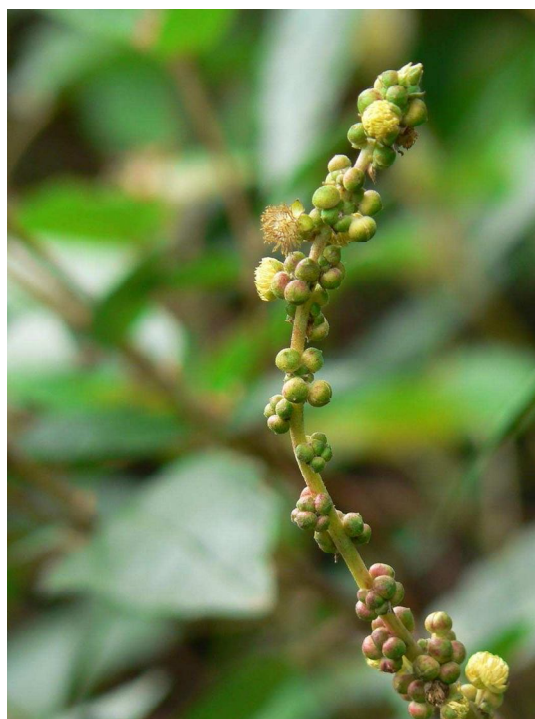
Adriana tomentosa var. tomentosa