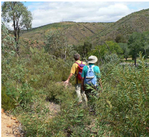
Wednesday walkers amid the luxuriant post fire growth

The walk starts at the western end of the Cotter campground and initially follows the Cotter River through regenerating vegetation from the 2003 bushfires which devastated the area. It crosses Paddy's River and passes the access to some caves before returning to the Cotter River and the main picnic area. The regeneration of several pomaderris species is vigorous – 5 species in total on the walk – P. angustifolia , P. aspera , P. betulina ssp. actensis , P. pallida (vulnerable) & P. subcapitata . Other interesting plants on the walk are Gynatrix pulchella and Adriana tomentosa var. tomentosa , which in February, was displaying the interesting inflorescences on the separate male and female plants.