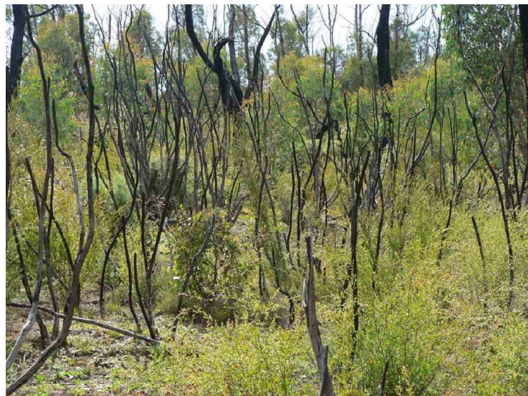
Post fire growth of Leptospermum brevipes