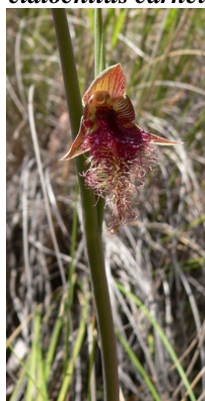
Calochilus ? platytilus