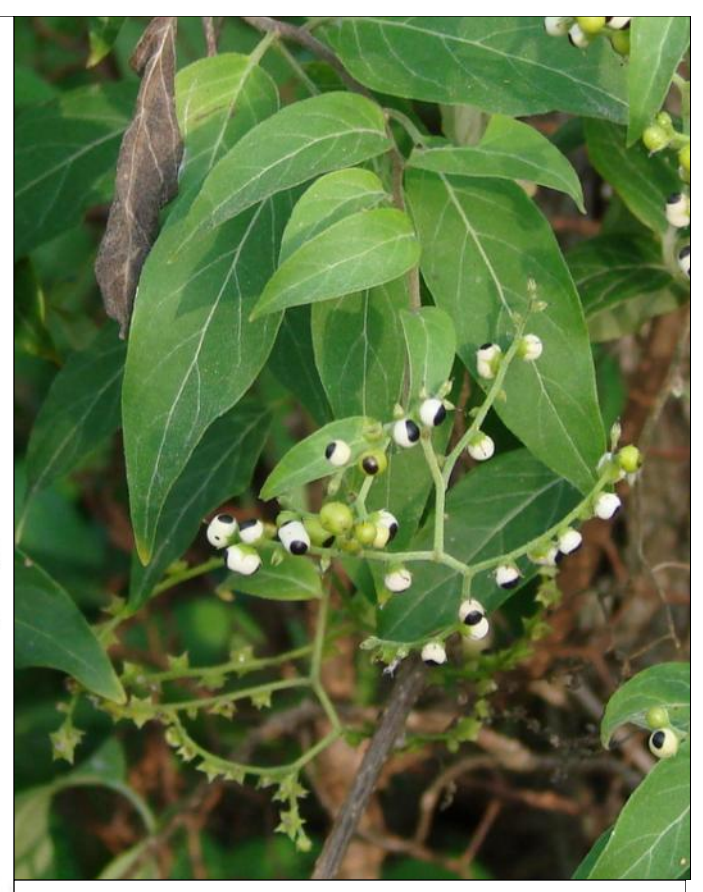
Above: Tournefortia volubilis , PDST 150. Native in the U.S. to Cameron & Hidalgo counties and Florida. Host plant to the Saucy Beauty day-flying moth, which resembles a butterfly.

A noteworthy cactus in the Arroyo brush is Blanck's Alicoche ( Echinocereus blanckii ). It is not common in any other brush in the area but is found all along the Arroyo.