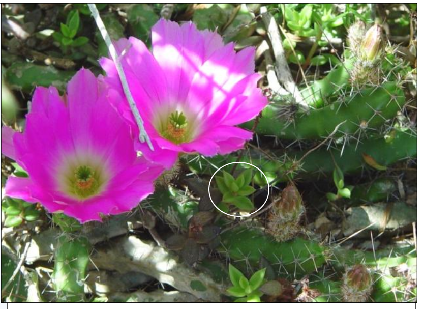
Photo above: White-center Alicoche, Ladyfinger cactus, Echinocereus pentalophus , PDST 165. Taxonomy on this species is confusing due to recent name changes. Blooms generally occur in late March over the course of about 2 weeks, with each bloom lasting only a few days. Note the small stonecrop (white circle), PDST 201. Rabbits love this small native succulent. It survives best in the protection of a spiny Echinocereus colony. Where spineless exotics have replaced cactus colonies, stonecrop is eaten to oblivion.

This paper was presented to the Fall 2000 meeting of the Native Plant Society of Texas, (NPSOT) held in Harlingen. It was also published in The Sabal, 17(6), December 2000.