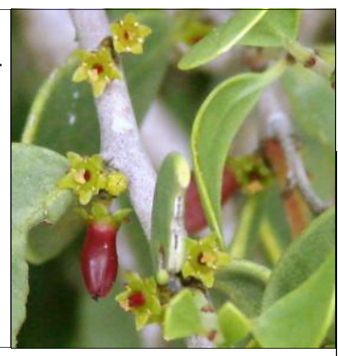
Table 1. Common Trees and Shrubs of the Arroyo Colorado brush in the LRGV, TX.

Photo right: Gutta Percha (Leather Leaf) in bloom, forming fruit. PDST 178.