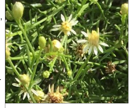
Photo right: Ericameria austrotexana, PDST 114, Monte de Conejo, ( Neonesomia palmeri ). Slender shrub, tolerates partial shade. Colonyformer; provides cover for rabbits. This is a wellwatered specimen. Frequent, tiny blooms.

Indio (Kalanchoe verticillata) an introduced succulent from South Africa, has become established, and is abundant and widespread. Indio was noted as common in the 1960's and is present in shorter brush from south of La Feria to the mouth of the Arroyo.