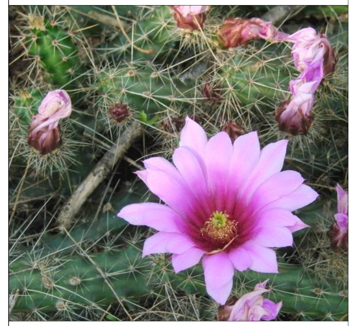
Above: Blanck's Alicoche, Echinocereus berlandieri , Dark-Throat Ladyfinger, PDST 163. Often blooms in mid-April. Large colonies occur naturally in Harlingen's Ramsey Park, remnants of Arroyo Colorado brush predating the city landfill.