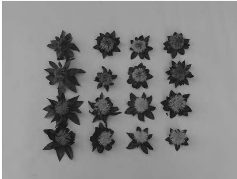
Figure 6.2 Variability for flower colour in safflower exhibiting (from left to right) orange in bloom turning to dark red on drying (O-dark red); yellow in bloom turning to yellow on drying (Y-Y); white in bloom turning to white on drying (W-W); yellow in bloom turning to red on drying (Y-R).