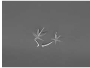
Figure 6.4 Safflower flowers showing petals, stigma, anther, carolla tube, and ovary.

flower develops into a single-seeded fruit called an achene, which is commonly known as seed. The pollen of safflower is yellow. Pollination occurs as the style and stigma protrude out of the fused anther tube. Unpollinated stigma remains receptive for several days. Outcrossing in safflower has been reported to range from 0 to as high as 59% in different genotypes in India (Patil et al., 1987). The outcrossing in genetic male-sterile lines in safflower is reported to be 100%, as no difference in seed yield of male-sterile and male-fertile plants under open pollination was observed (Singh, 1996). Safflower pollen is transferred by insects and not by wind. The most prevalent pollinator agent in safflower is honey bees. Bees visit the safflower flowers for both pollen and nectar. Each safflower capitulum produces 15 to 60 seeds.