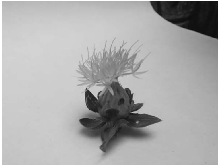
Figure 6.3 Safflower capitulum having several flowers.

several flowers, with the number ranging from 20 to 250 (Figure 6.3). Flowers are enclosed by bracts in circular order. The disk flowers are attached to a flat or convex receptacle. In addition to the flowers, hairs or bristles are interspersed in between the flowers in a capitulum. A safflower flower is composed of petals that are attached to a corolla tube (Figure 6.4). The corolla tube in turn is attached at its base to an inferior ovary. Five fused anthers are attached to the corolla tube and surround the style and stigma. The corolla tube is 1.8 to 3 cm long and the five petal lobes are 6.5 to 8.5 mm long. Anther tube is 5 to 7 mm in length. The stigma, which is surrounded by five fused anthers, projects beyond the top of the anther tube by 5 to 6 mm. The inferior ovary in each