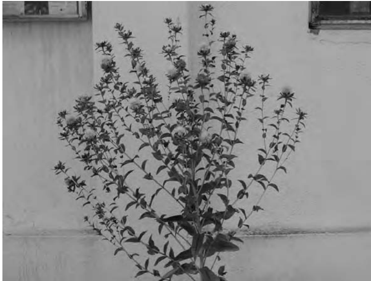
Figure 6.1 Single plant showing primary, secondary, and tertiary heads.