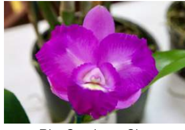
Rlc. Capricorn Charm