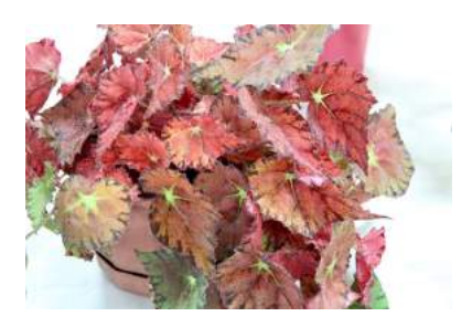
Begonia Golden Glow Nita