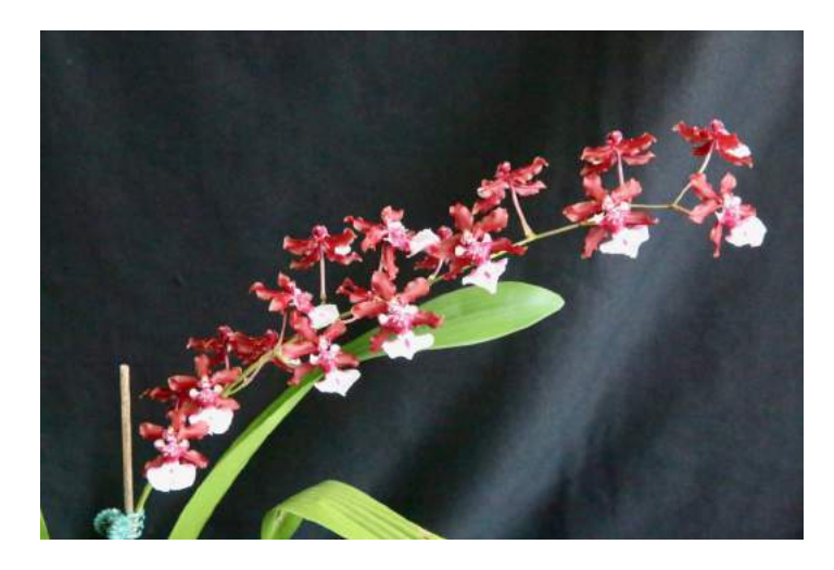
Judges Choice - Novice - Onc. Sharry Baby.

I purchased Cycd.Taiwan Gold from Robertsons Orchids in 2016. I grow it in spag moss and fertilize ( with high N fertiliser ) and or water it every day from when roots are 3" or more long until late April when I cease fertilizing and just water every 2-3 days. I grow under 30% shade cloth in a shade house 2.4 wide x 1 deep x2 high which provides plenty of air movement and light. Michael & Betty