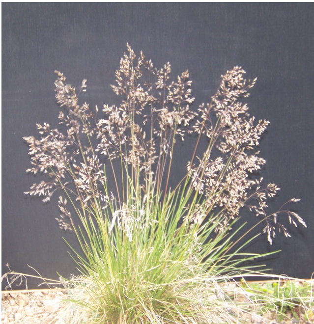
tufted hairgrass Deschampsia caespitosa