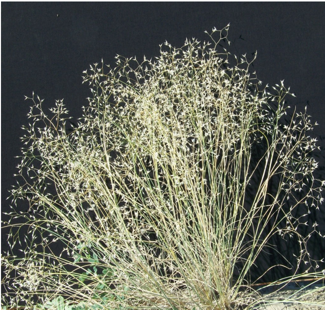
Indian ricegrass Achnatherum hymenoides (aka Oryzopsis hymenoides )