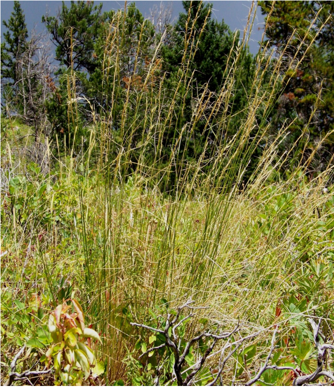
bluebunch wheatgrass Pseudoroegneria spicata (aka Agropyron spicatum )