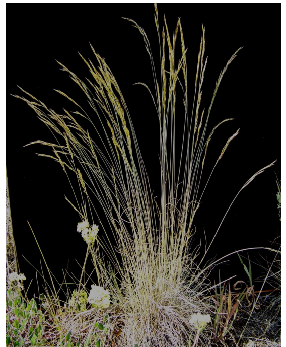
Idaho fescue Festuca idahoensis