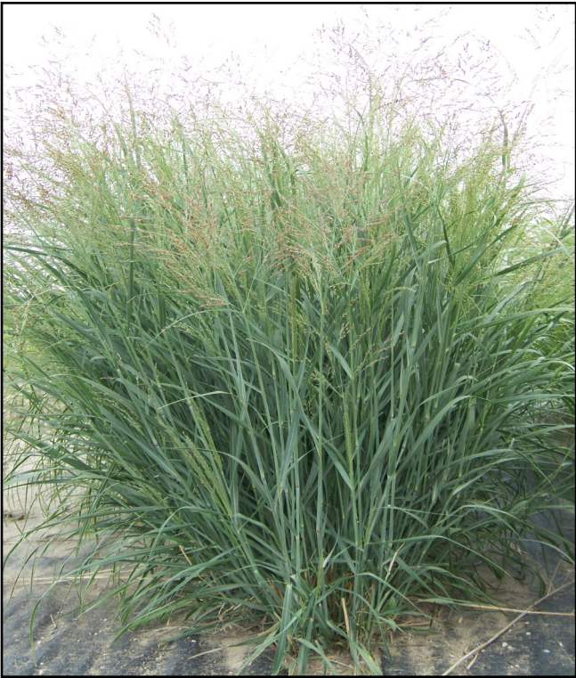
switchgrass Panicum virgatum