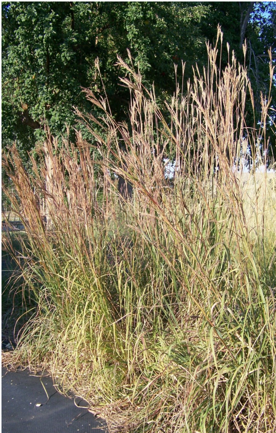
big bluestem Andropogon gerardii