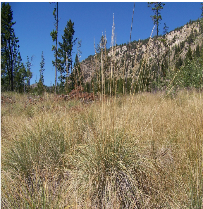
rough fescue Festuca scabrella campestris