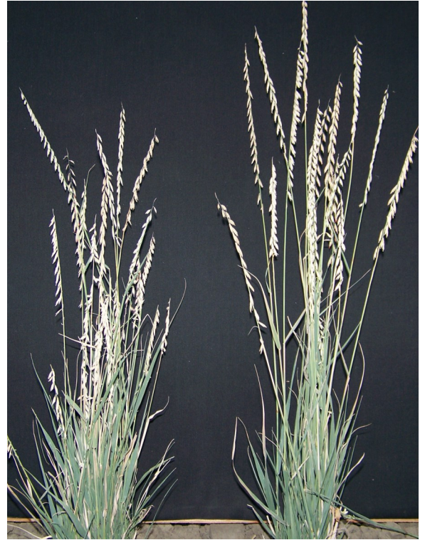
sideoats grama Bouteloua curtipendula