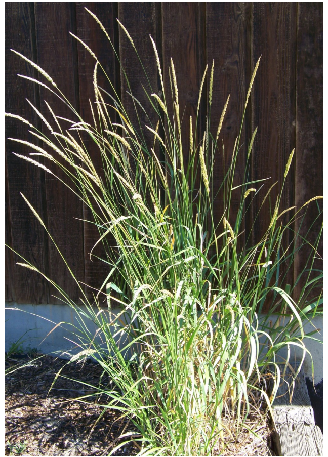
basin wildrye Leymus cinereus (aka Elymus cinereus )