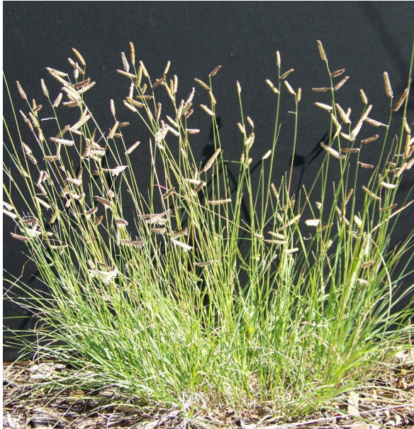
blue grama Bouteloua gracilis