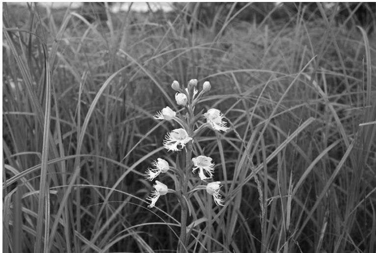
Figure 1. Platanthera leucophaea in wet swale on private property, Grundy County, Missouri, 14 June 2010.