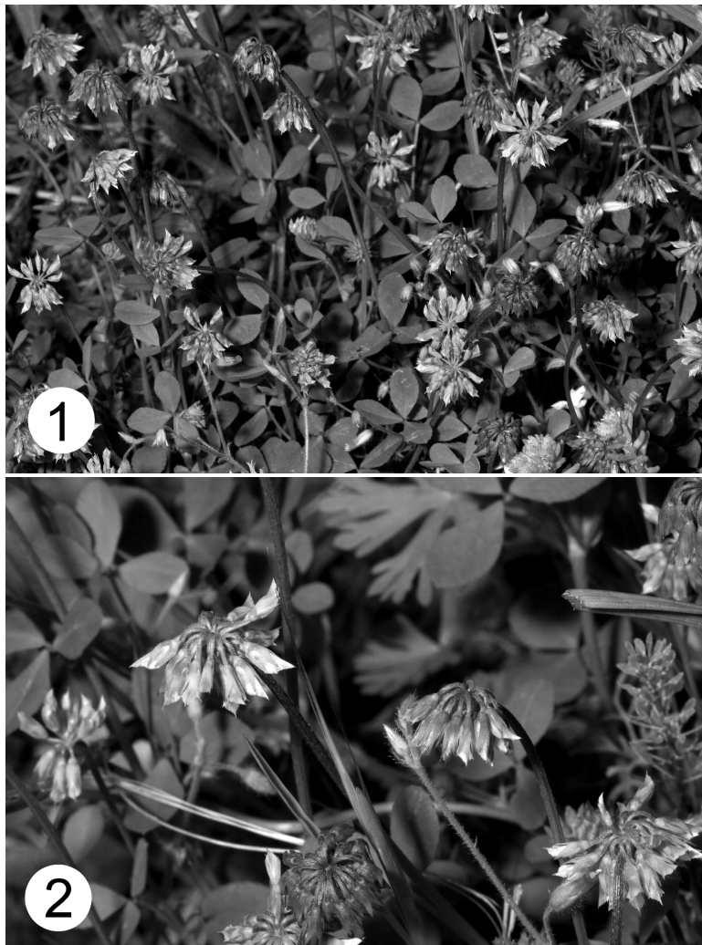
Figures 1, 2. Habit and inflorescences of Trifolium carolinianum , Wildcat Glades Conservation and Audubon Center, Joplin, Newton County, Missouri; 1 May 2011.

and found additional plants. In combination, approximately 32 clumps/patches and over 1,000 flowering heads were recorded at the two sites. Plant associates noted at the Wildcat Glades Center on 1 May included Allium canadense , Camassia scilloides , Chaerophyllum procumbens , Cheilanthes lanosa , Hypoxis hirsuta , Geranium maculatum , Krigia virginica , Melica nitens , Minuartia