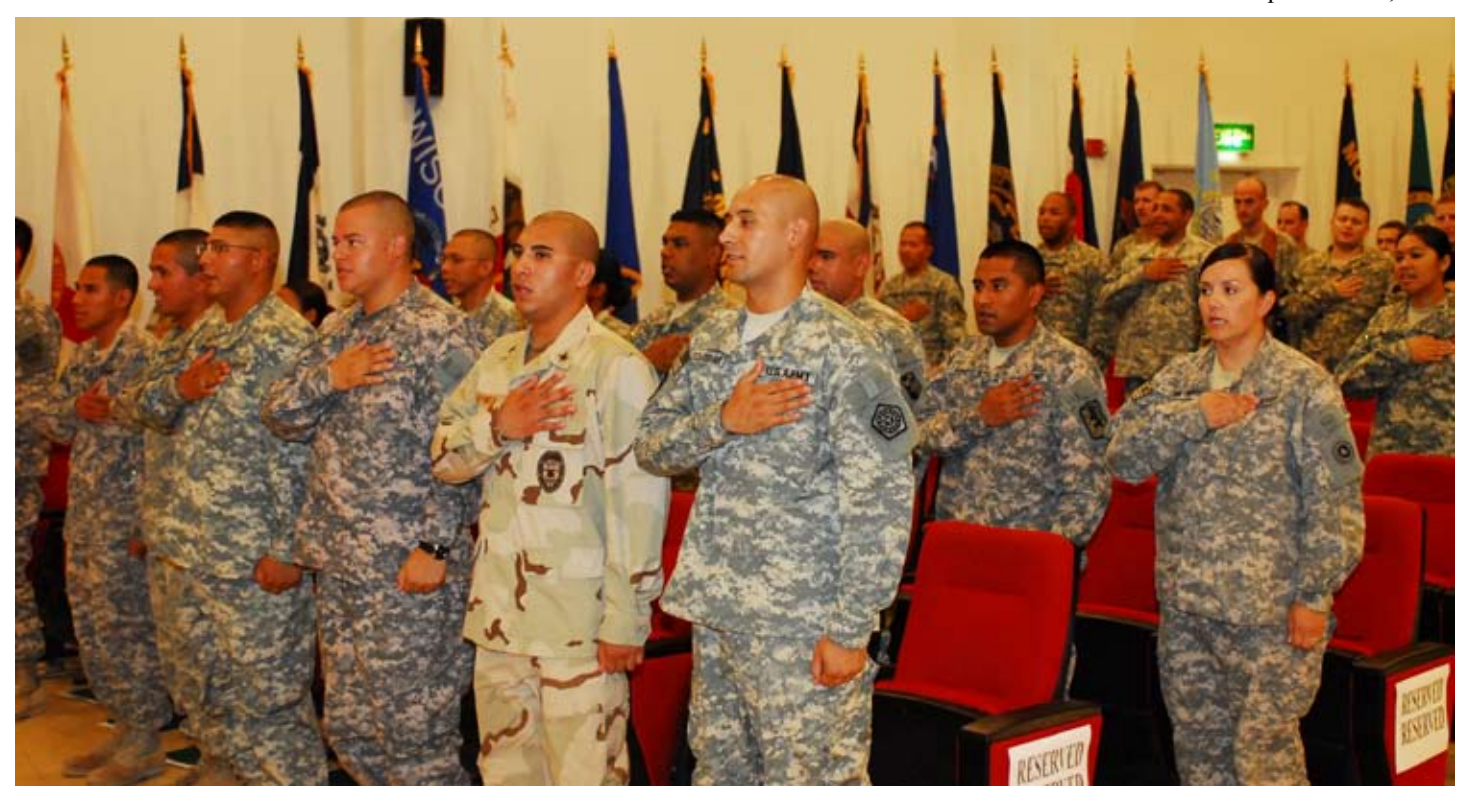
The newly naturalized citizens placed their hand over their heart and recited the Pledge of Alligence.