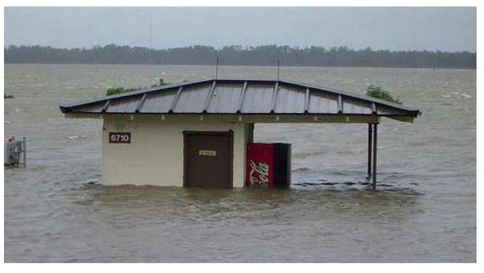
Just visible over the flood waters of a major hurrican in Mississippi, is a coke machine.

his home sustained only minor damages such as lost shingles, gutters, and damage from flying debris