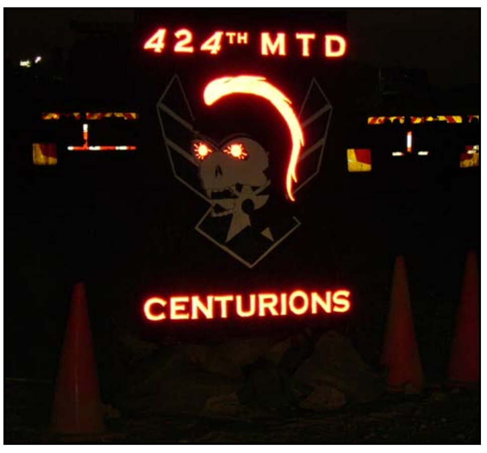
The 424 Medium Truck Detachment logo stands lighted in the night sky in the Centurion area in the JLTF 28 motorpool.

mail, modern day armor is made of synthetic fibers called Kevlar used in the Improved Outer Tactical Vest weighing approximately 30 pounds, about three pounds lighter than previously issued protective vests.