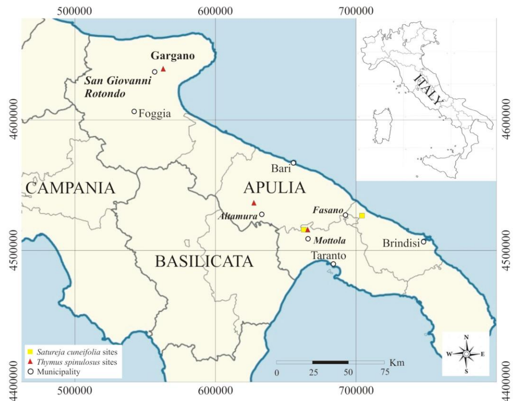
Figure 1. Site locations of Satureja cuneifolia and Thymus spinulosus .

Within the San Basilio site in the province of Taranto, the most widespread pedo-type is Lithic Ruptic–Inceptic Haploxeralf fine, predominantly clayey, very thin, and very rocky with substrate within 50 cm [21]. At Scannapecora in the province of Bari, the geological type is that of Skeletal limestones of neritic and carbonate platform facies (Upper Cretaceous), on Tyrrhenian carbonate reliefs with material defined by calcareous sedimentary rocks and climate from Oceanic to Suboceanic Mediterranean, partially mountainous. The Difesa di Malta and S. Egidio sites share the same ecopedology as the Scannapecora site but different geopedology and geolithology, respectively, with Terrigenous-skeletal limestones such as “Panchina” (Pleistocene) and Colluvial, terraced alluvial, fluviolacustrine and fluvioglacial deposits (Pleistocene) (Geological, Geolithological and Ecopedologic maps—Italian Ministry for the Environment, Land and Sea, http://www.pcn.minambiente.it/viewer , accessed on 26 May 2021) [20] (Table 2).