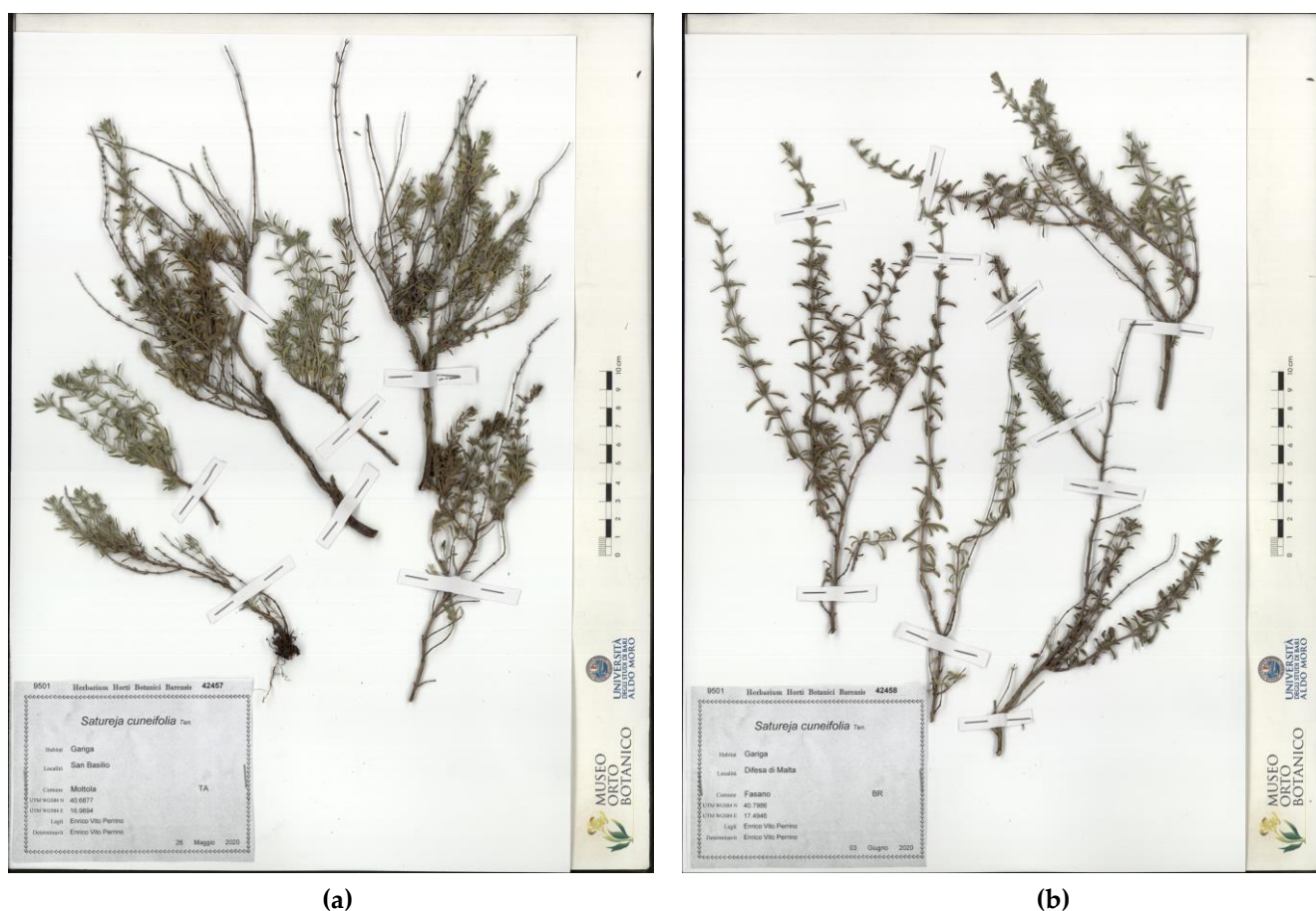
Figure 3. S. cuneifolia herbarium samples: (a) San Basilio (Mottola) (BI 42457); (b) Difesa di Malta (Fasano) (BI 42458).

The genus Satureja L. comes from the Latin “ satureia ” and was first named by Roman writer Pliny [38]. It means “ herb of satyrs ” and, for this reason, its cultivation was banned in monasteries [39]. S. belongs to the Lamiaceae family, sub-family Nepetoideae , and the tribe Menthae [40] including about 200 wild species of herbs and shrubs, often aromatic, widely distributed in the Mediterranean area, Asia and boreal America [41,42]. More than 30 of them grow in eastern parts of the Mediterranean area [43,44], up to 1200 m above sea level, in arid, sunny, stony and rocky habitats [45], 5 of which are in Italy: S. cuneifolia Ten.,