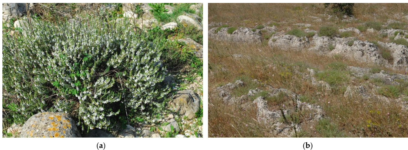
Figure 2. S. cuneifolia (a) in flowering; (b) in its habitat, Phagnalo saxatili-Saturejetum cuneifoliae . San Basilio, 26 March 2020.