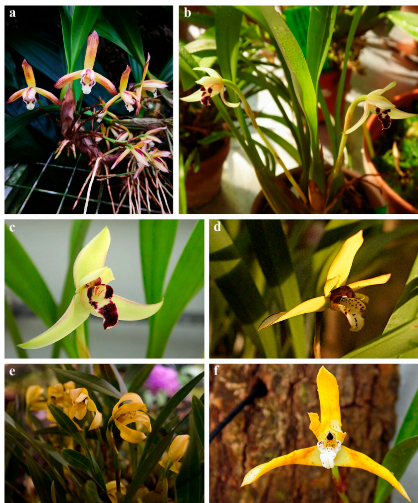
Figure 1. Flowers of Brasiliorchis species examined to date: (a) B. gracilis ; (b,c) B. marginata ; (d) B. picta ; (e) B. porphyrostele ; (f) B. cf. porphyrostele .