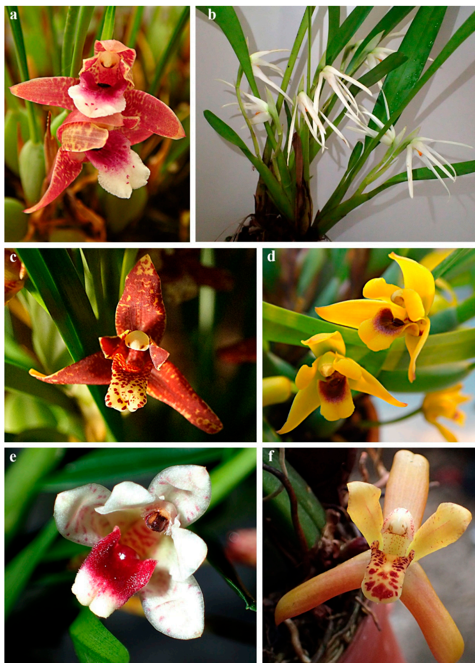
Figure 3. Flowers of Maxillariinae species examined to date: (a) Maxillariella sanguinea ; (b) Maxillaria splendens ; (c) Maxillariella tenuifolia ; (d) M. variabilis ; (e) M. vulcanica ; (f) Xanthoxerampellia rufescens .

Orchids are widely used in traditional medicine for the treatment of a whole range of different health conditions: skin issues, infectious diseases, digestive problems, respiratory issues, reproduction malfunctions, circulation and heart problems, tumors, pain, and fever. Indeed, throughout the ages, orchid extracts were attributed to some activities such as diuretic, anti-inflammatory, or antimicrobial. For example, Ecuadorian healers (los curanderos) use stem and flower extracts of Epidendrum secundum Jacq. to heal nervous disorders and liver diseases [28]. Stanhopea anfracta Rolfe is utilized in treating cough and lung diseases thanks to the presence of eucalyptol in its flowers [28]. Some species are used as emetics, aphrodisiacs, vermifuges, bronchodilators, and sex stimulators or