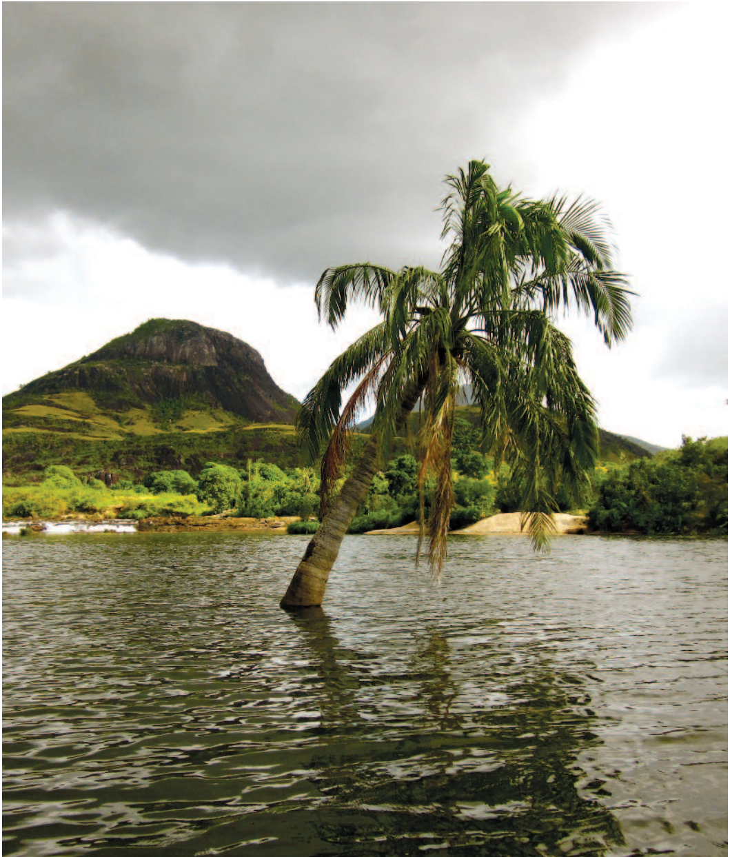
6. A lone R. musicalis adult near Vohibola village on the Ebakika.