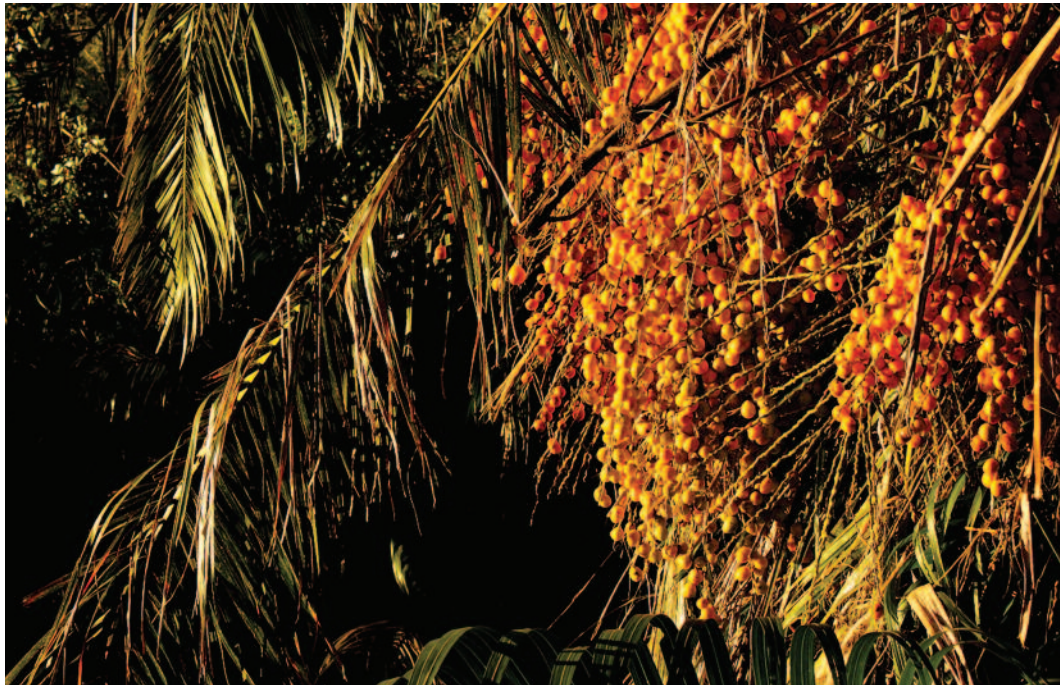
3 (top). A temporary canoe carved from the trunk of R. musicalis . 4 (bottom). Fruits.

The upstream riverine vegetation was dominated by Typhonodorum lindleyanum (Araceae), Mascarenhasia arborescens (Apocynaceae), Harungana madagascariensis (Hypericaceae), Pandanus platyphyllus (Pandanaceae), Bambusa sp. (Poaceae), Cynometra sp. (Fabaceae) and Syzygium sp. (Myrtaceae). Large, iridescent aquatic skinks ( Zonorsaurus maximus )