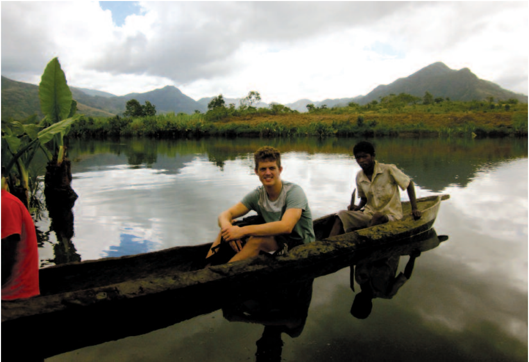
5. Searching the Ebakika River by lakana .