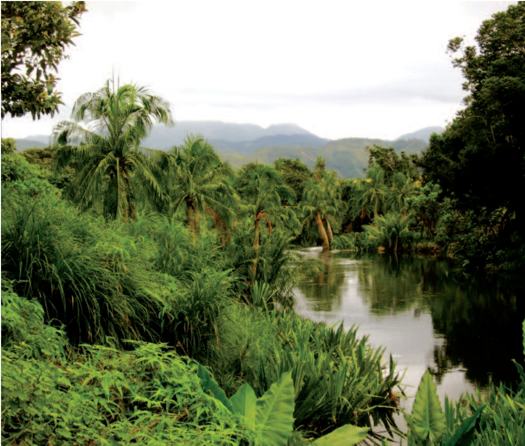
7. Ravenea musicalis in the Vatomirindry River.

and/or increased siltation from land conversion to agriculture could be inhibiting the establishment of young plants. In line with Beentje (1993), we believe that R. musicalis appears to require sandy riverbeds to flourish; individuals sprouting on submerged rocky pavements (or on fluvial deposits) fail to attain maturity. Over the next decade, land conversion for food production is likely to accelerate with projected increases in human population within Anosy (Vincelette et al. 2007).