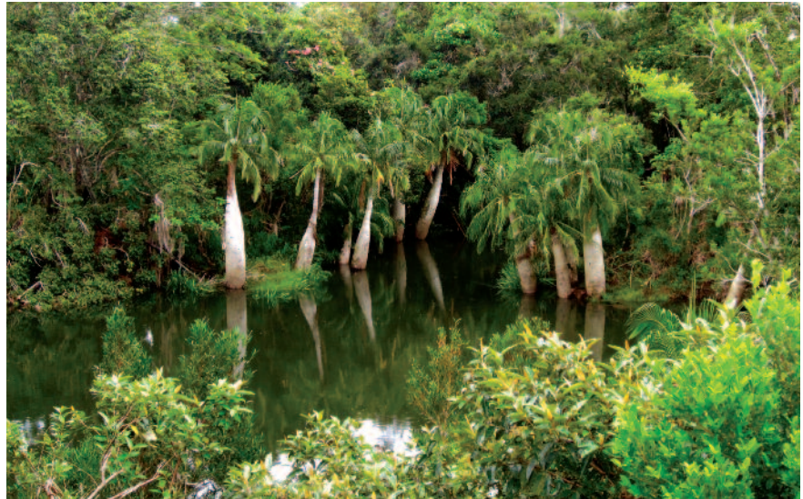
1. Ravenea musicalis in its natural habitat, the Vatomirindry River.

Kingsmead Road, London, SW2 3HY, UK jhenshall87@gmail.com