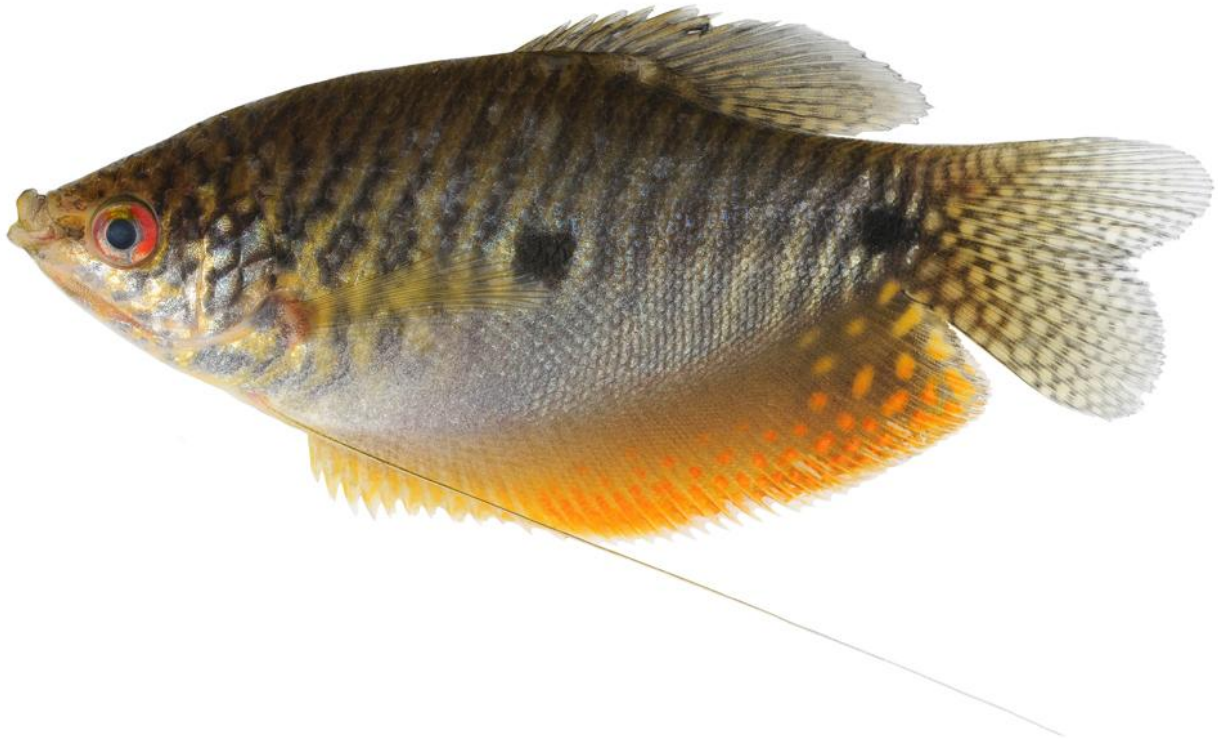
Fig. 1. Trichopodus trichopterus , male of 61.6 mm SL from Sungei Buloh Wetland Reserve..