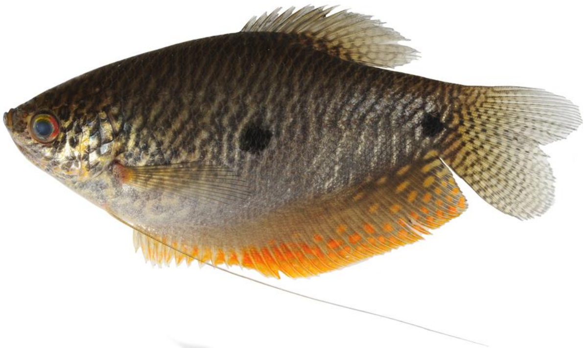
Fig. 2. Trichopodus trichopterus , female of 75.5 mm SL from Sungei Buloh Wetland Reserve. (Photograph by: Tan Heok Hui).

Mar.1988); Anonymous, 1989: 5 (brackish water pond at Woodlands Town Gardens in Feb.1989); Lim & Ng, 1990: 97 (rural and forest streams, ponds and reservoirs); Munroe, 1990: 112 (common in many rural and outlying streams in the Mandai, Nee Soon and other northern areas); Ng & Lim, 1992: 259 (Nee Soon Swamp Forest); Lim, 1995: 162 (Bukit Timah Nature Reserve in Catchment Pond); Ng & Lim, 1996: 114 (Jurong Road, ditches near Sembawang Hot Spring, West Coast Road, Sg. Kranji along Choa Chu Kang Road, Jurong Road, Mandai, adjacent streams of Upper Seletar Reservoir); Ng & Lim, 1997: 252 (Central Catchment Nature Reserve in exposed water bodies); Lim et al., 2000: 21–22 (pipeline pool and range area in Nee Soon Swamp Forest, freshwater pond at Sungei Buloh Wetland Reserve, streams and ponds at Ulu Sembawang and Lorong Gambas, streams at Upper Seletar Reservoir Park); Subaraj et al., 2000: 6