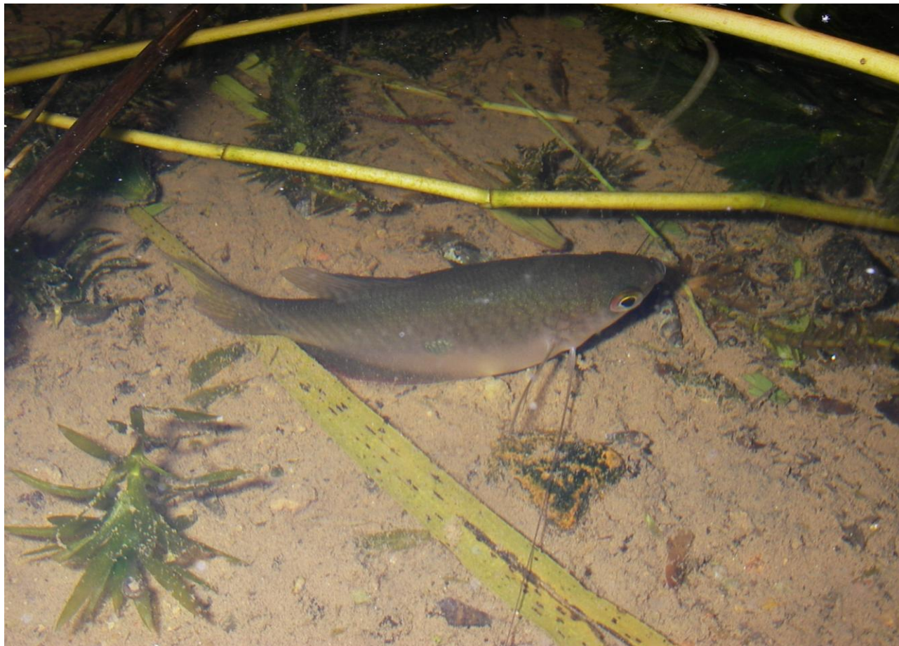
Fig. 4. Trichopodus trichopterus of about 8 cm TL, at night in a pond at the Kranji Marshes. (Photograph by: Kelvin Lim).