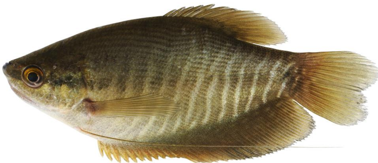
Fig. 5. Trichopodus pectoralis , male of 96.6 mm SL from Sungei Buloh Wetland Reserve.

Material examined. — Mandai, in rural stream: ZRC 5635 (1), 1988; ZRC 6824 (1), Apr.1988. Nee Soon Swamp Forest: ZRC 19853 (1), Jan.1992. Sungei Buloh Wetland Reserve, fish ponds: ZRC 23017 (3), Jul.1992. Sungei Peng Siang: ZRC 804 (1), Oct.1966. Sungei Whampoa: ZRC 6462 (2), Jun.1961. Sungei Kallang, outlet of Lower Peirce Reservoir: ZRC 1264 (4), Jan.1964. Woodleigh: ZRC 1100 (1), undated. Sungei Punggol: ZRC 51388 (2), Oct.1965. Singapore (no other data): ZRC 1099 (1), 1934; ZRC 1101 (1), 1900. Largest specimen: 140.0 mm SL (from ZRC 804).