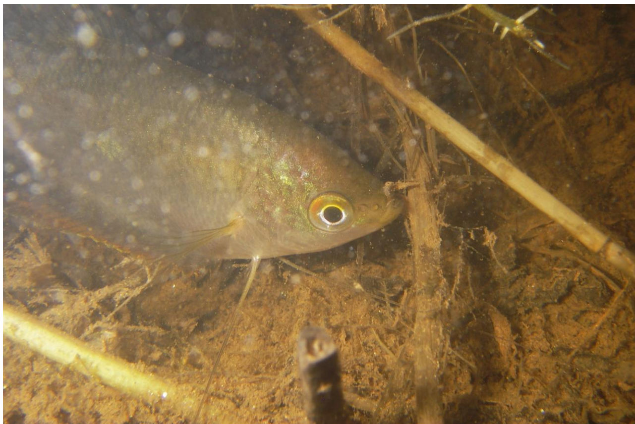
Fig. 3. In situ underwater image of Trichopodus trichopterus of about 6 cm TL in a freshwater pond at Sungei Buloh Wetland Reserve.