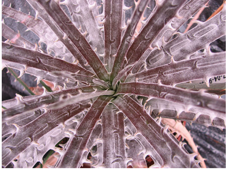
Fig. 8 Dyckia milagrensis .

long acuminate tip, equalling or exceeding the internodes, serrulate towards the apex; fertile Inf part usually lax at anthesis, \pm 30 - to 40-flowered, 7–35 cm, white-furfuraceous; floral Bra spreading or reflexed, like the peduncular bracts, equaling or exceeding the flowers (lowest), usually serrulate; Fl \pm spreading; Ped to 4 mm; Sep broadly elliptic, 7–9 mm, acute, densely lanate-lepidote; Pet suborbicular, 11–14 mm, carinate, suberect, orange-yellow; St included; Fil 2 mm connate above the common tube; Anth narrowly triangular, acuminate, recurved; Ov massively pyramidal-triangular; Sty very short; Fr trigonous-ellipsoid, 14 mm, almost black, glossy; Se 4 mm, basally pointed, alate towards the tip.