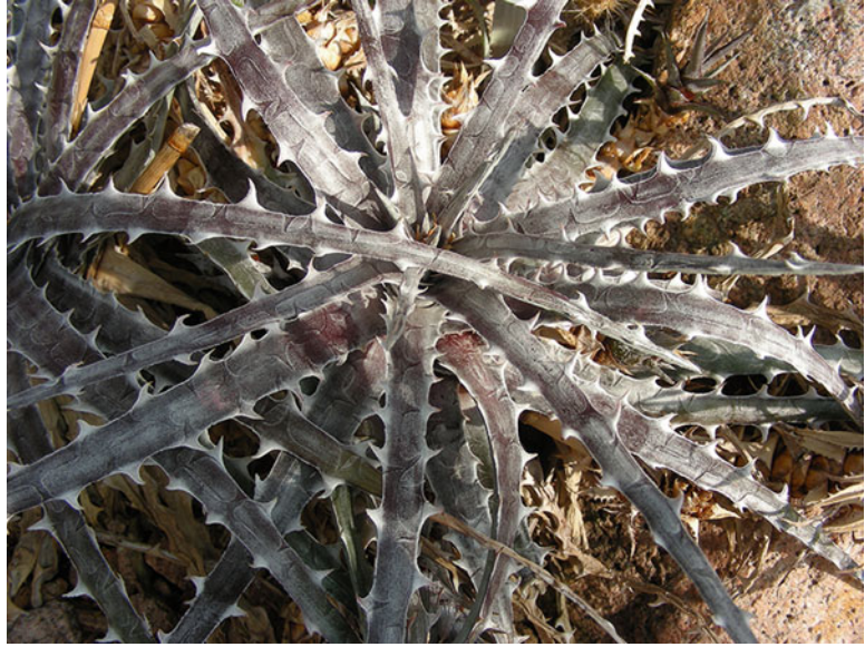
Fig. 6 Dyckia goehringii (Esteves Pereira s.n. in Rauh 67622: Brazil; Goiás, near Portelândia; type collection).

(or completely free according to Fig. 3 in Pinangé & al. (2017)), basally broadly complanate, attenuate; Anth golden-yellow, sagittate; Sty very short, Sti papillate.