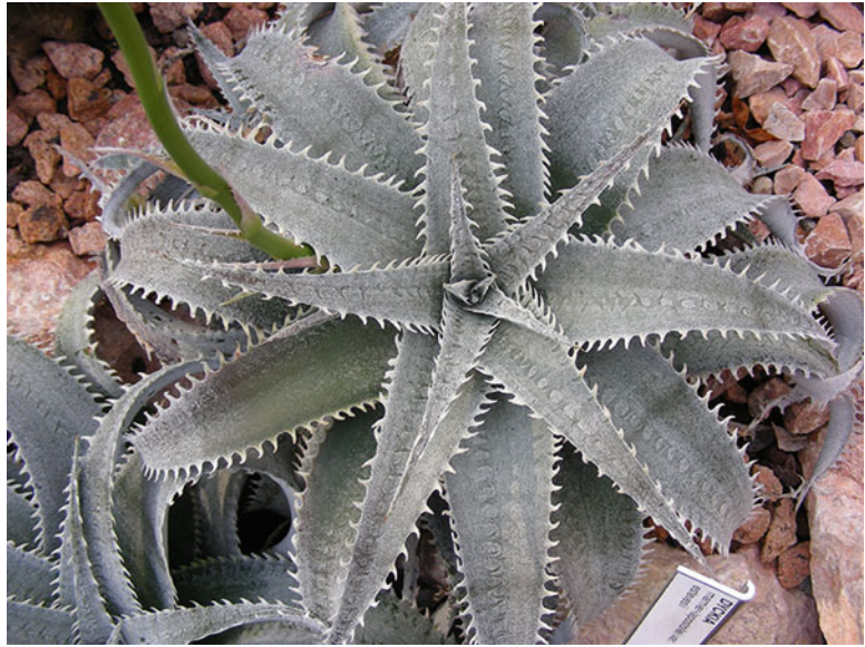
Fig. 7 Dyckia marnier-lapostollei var. estesvesii .

antrorse, 3–4 mm, light green with a castaneous apex, 10–15 mm apart; Inf 70–100 cm, simple; peduncle erect, 55–70 cm (to 97 cm according to the protologue), green, sparsely white-lepidote; peduncular Bra subfoliaceous (lowest) to lanceolate-attenuate (upper), densely arranged, clasping the peduncle, erect, chartaceous, 11–12.5 × 0.9–1.2 mm (lowest), exceeding to rarely equalling the internodes (upper), stramineous, glabrous to sparsely lepidote, spinulose to inconspicuously serrulate; fertile Inf part 38- to 65-flowered, lax, straight, 30–43 cm, orange, sparsely white-lepidote; floral Bra elliptic to elliptic-attenuate, acuminate, exceeding to equalling the middle of the sepals, 4–12 × 3–6 mm, castaneous, white-lepidote, entire; Fl patent at anthesis, suberect afterwards; Ped 1–2 mm, to 4 mm in fruit, cylindrical, orange, sparsely lepidote; Sep ovate, 7–9 × 4–6 mm, apex rounded, orange, apex castaneous, white-lepidote; Pet obtrullate, 9–12 × 9 mm, apex emarginate, erect, orange, glabrous; St included; Fil ±1.5 mm connate (completely connate according to Fig. 3 of Pinangé & al. (2017)) above the 2.5 mm high common tube; Anth slightly sagittate at the base, attenuate and reflexed at the apex, ±3 mm; Ov ±7 mm; Fr ±15 mm; Se alate, ±3 mm.