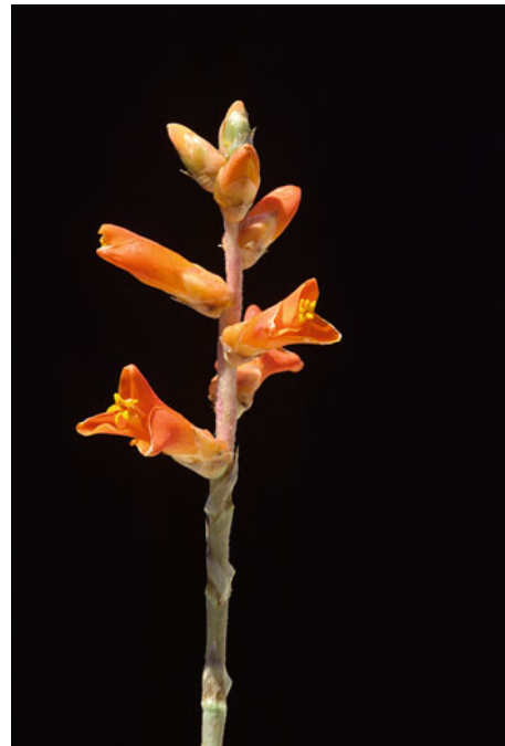
Fig. 9 Dyckia remotiflora var. remotiflora (Birolini s.n.: Uruguay; Maldonado, Punta Ballena).

D. remotiflora var. remotiflora — Distr: Brazil (Minas Gerais, Paraná, São Paulo, Rio Grande do Sul), Uruguay; rocky fields, savanna, on rocks or terrestrial. — Fig. 9.