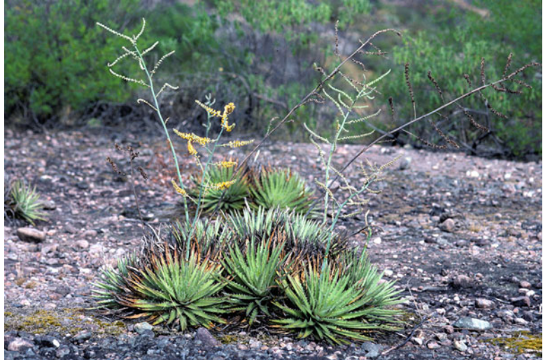
Fig. 1 Dyckia alba (Eggl 2470: Brazil; Rio Grande do Sul; Pedras de Segredo).

like, with dark brown pungent tip, longer (lower) or shorter (upper) than the internodes, spinose; fertile Inf part 3× branched, glabrous; Br shortly white-tomentose, densely many-flowered; floral Bra small, to 2 mm; Fl sessile, widely opening; Sep broadly triangular, acute, subcarinate, to 4 mm, abaxially white-tomentose; Pet broadly ovate, to 8 mm, yellow; St equalling the petals, exerted at anthesis; Fil free above the 0.5 mm high common tube; Sty exerted for 3 mm; Fr and Se not described.