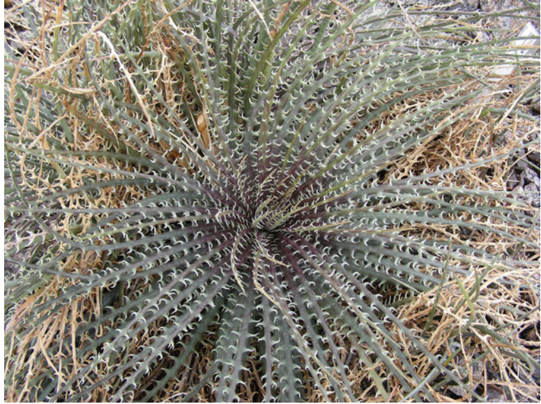
Fig. 3 Dyckia dawsonii (Dawson 15236: Brazil; Goiás, E of Formoso, type collection.).

do Sul ( Larocca & al. 96/001 [ICN, MBM, US, ZSS]). — Lit: Sachs (2011: with ills.). Distr: Brazil (Rio Grande do Sul); basalt outcrops.