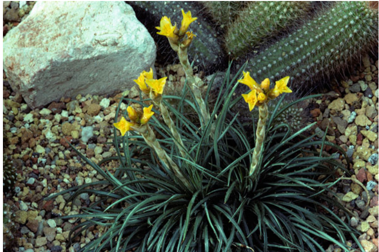
Fig. 2 Dyckia choristaminea (Kirschnek s.n.: Brazil; Rio Grande do Sul, sine loco).

villous, subterete; floral Bra like the peduncular bracts, carinate towards the apex, 15 mm, equaling the sepals, entire; Ped short, stout; Fl 18–24 mm, \pm funnel-shaped; Sep very broadly ovate, acute, 10–11 mm; Pet lobes spreading to recurved at anthesis, yellow; St included to slightly exserted; Fil free above the very short common tube; Ov 8 mm; Sty very stout, 8 mm.