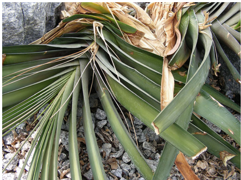
Fig. 5 Dyckia estevesii .

[2] Ros fan-like, clump-forming, stem to 10 cm \varnothing , thickened towards the base, densely covered by leaf sheaths, branching at the base; L numerous, distichous, spreading-recurved, sheath distinct, densely imbricate, to 5 \times 10 cm, green with brown base, soon stramineous, glabrous, upper margins with wing-like scales, sulcate abaxially, persistent, L lamina erect (younger) to spreading (older), to \pm 30 \times 3.5 cm,