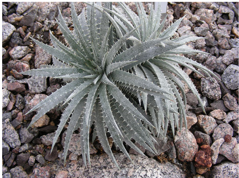
Fig. 4 Dyckia domfelicianensis (Sachs s.n.: Brazil; Rio Grande do Sul; Arroio dos Ratos).

[1] Ros very many-leaved (100–300 leaves), 50 cm \varnothing , with a short stem; L sheath \pm 3.5 \times 5.5 cm, dark brown, glossy on both faces, L lamina 23\text{--}25 \times \pm 3.5 cm, tough and succulent, acuminate, acute, clear green, cinereously white-lepidote, with pungent tip, margin spinose, Sp hooked, antrorse, brown; Inf to 120 cm, 1\text{--}2 \times