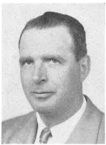
ALLISON GREEN Speaker, House of Representatives Tuscola County