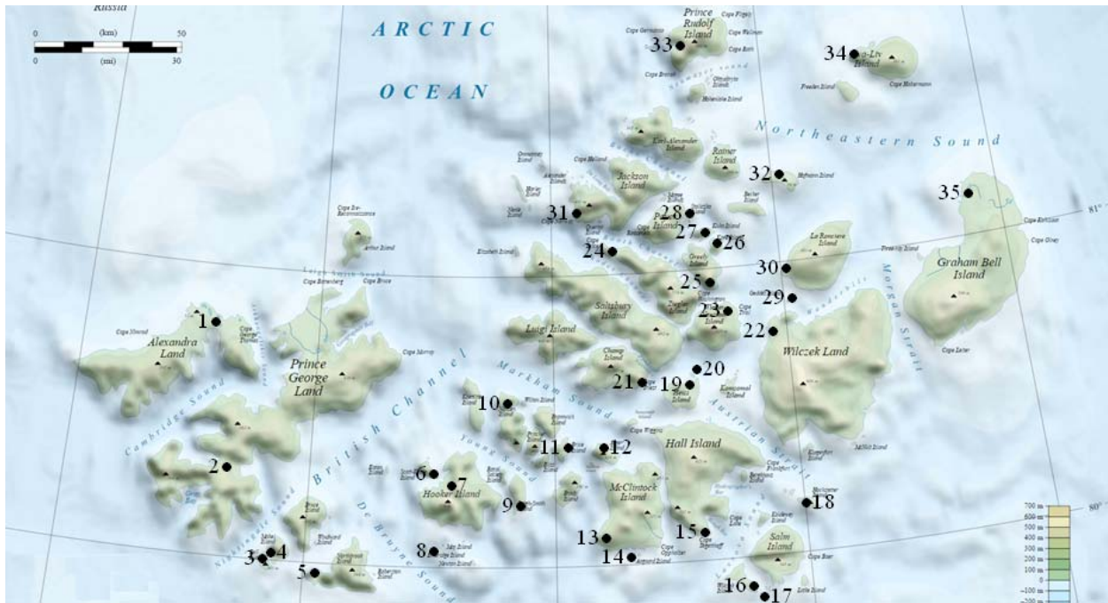
Fig.1. Collecting localities and collectors of mosses in Franz Josef Land: