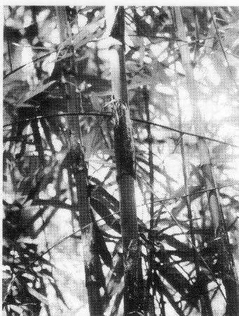
Fig.5. Bambusa ooh Widjaja & Astuti