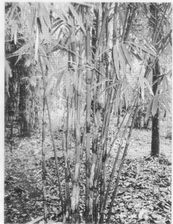
Fig.4. Gigantochloa taluh Widjaja & Astuti