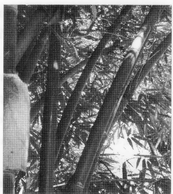
Fig.6. Schizostachyum castaneum Widjaja