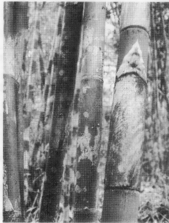
Fig.3. Gigantochloa aya Widjaja & Astuti