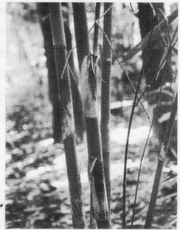
Fig.2. Gigantochloa baliana Widjaja & Astuti