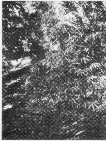
Fig.1. Dinochloa sepang Widjaja & Astuti

Tabanan district has one endemic bamboo species namely buluh kedampal ( Schizostachyum castaneum Widjaja), Fig. 6. This bamboo is simpodial with dense clumps, erect culm can reach 15 m in length, 45 - 70 cm internodes, 4.5 - 6 cm in diameter. Thin-walled bamboo