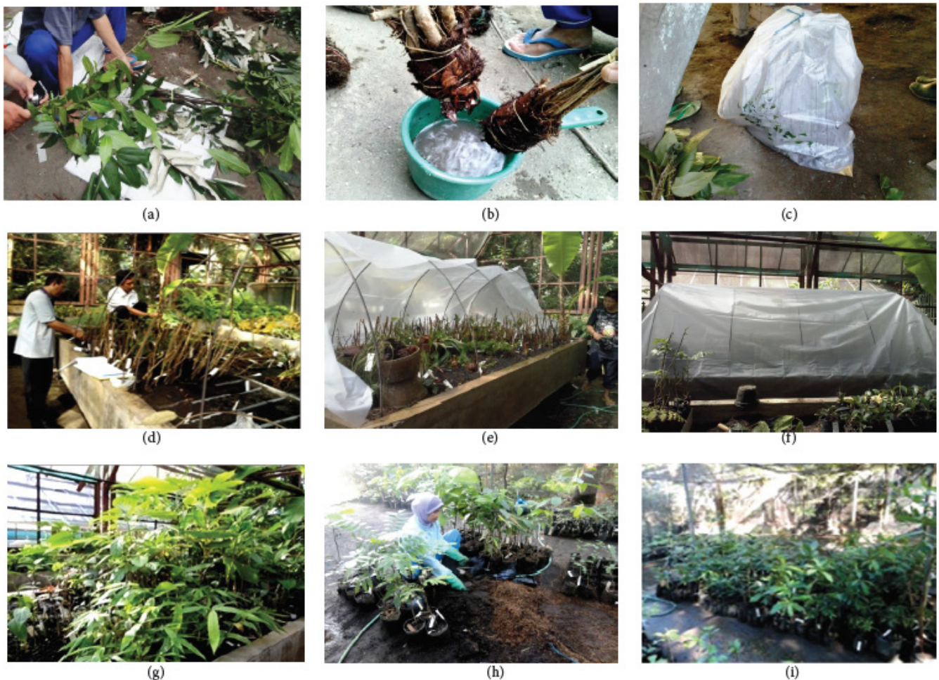
Figure 1. General treatment step of plant material from exploration (seedling material collection). a until c is treatment in field, d until i is treatment until come in nursery at Purwodadi Botanic Garden. a) reducing of leaves and then wrap the roots with moss, b) material dipped in a rootone solution, c) caps the plant material with plastic, after plant material come in nursery then d) growing material in pure sand, e) & f) covered plant material with plastic, g) plant material was growth, h) transplanting plant in polybag, i) maintenance plants in paranet house.