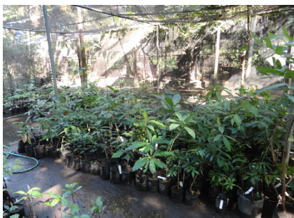
Collections from NTT

The treatment of material plants collection in field is also effects of plants adaptation. Appropriate methods are needed to reduce the number of dead plants at the field. For ferns, wrapping the roots with black plastic to maintain the stability of auxin at the root (Hartini, 2006). Soaking roots with Rootone liquid can be applied to stimulate of root growth (Wawangnigrum and Puspitaningtyas, 2008). Benlate fungicide solution (Benomyl 0.03%) can be used to reduce the decay of the material cutting (Danthu et al , 2002).