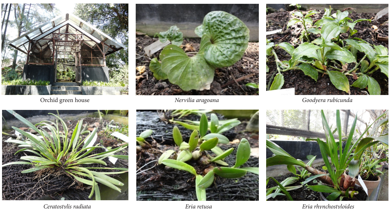
Figure 5. Orchid Collection from East Nusa Tenggara

Watering is an important factor for epiphytic orchids acclimatization. Epiphytic orchids obtain nutrients and water through their media and air. Purwodadi Botanic Garden greenhouse orchids are sprinkling in the morning, between Monday to Friday. On Saturday and Sunday are not done. Frequency factor of irregular sprinkling is also a cause of many epiphytic orchids dry. In green house orchid, epiphytic orchid are planted on tree fern media. They can not keep the water in long time. They need suitable media to epiphytic orchid, especially the unresistant orchids in drought. Moss media can be applied to add tree fern media. Moss media can keep the water in long time, so drought orchid problem can be reduced.