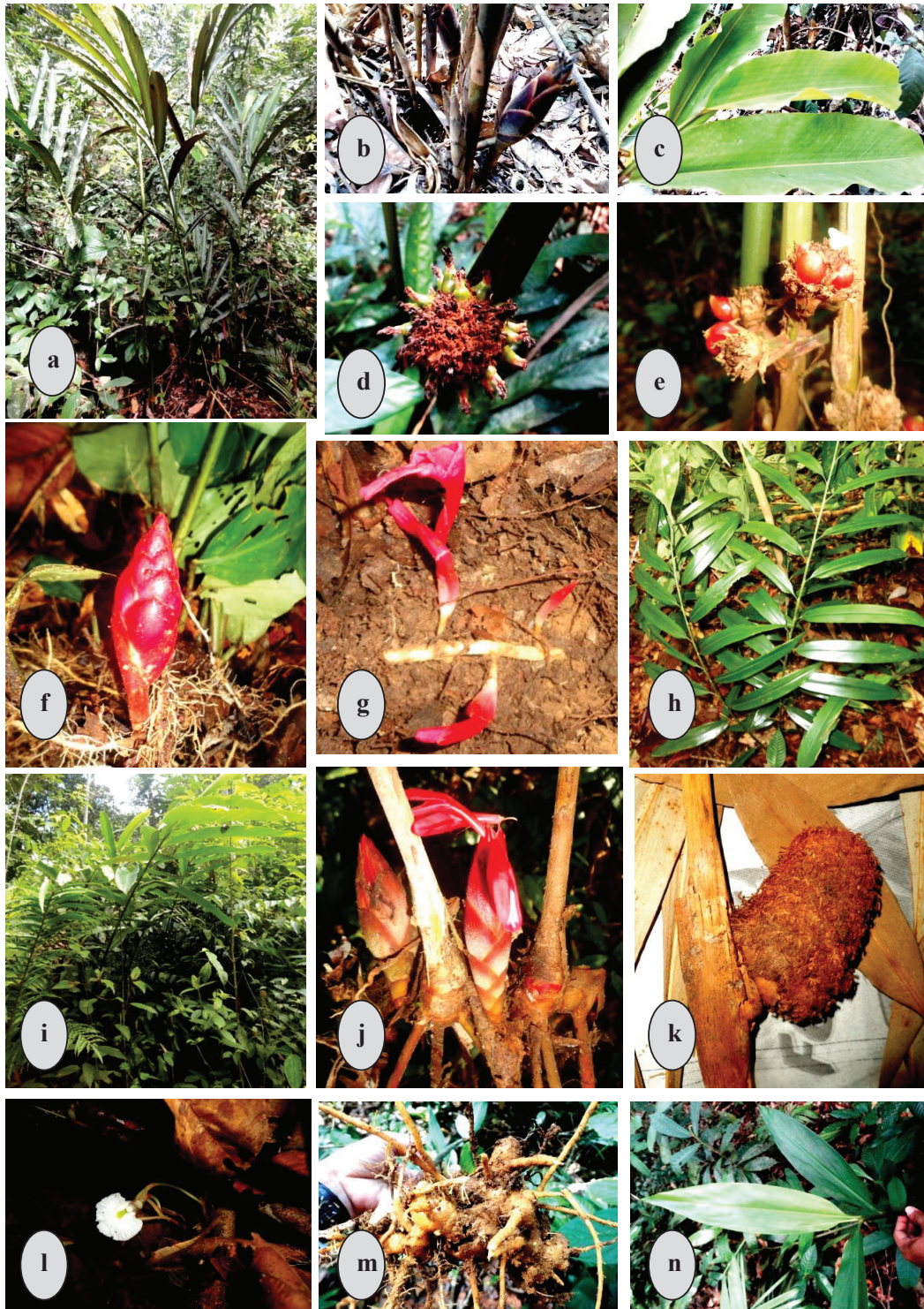
FIGURE 2. Diversity Zingiberaceae Species in Besiq Bermai East Borneo Forest: a) Alpina beamanii, b) & c) Hornstedtia rumphii, d) Plagiostachys breviramosa, e) Plagiostachys bracteolata, f) Zingiber aromaticum, g)