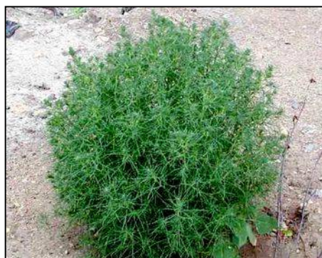
Salsola collina Pall.

Introduction. Salsola collina Pall. belongs to the genus of Salsola herbaceous and shrubby plants of Amaranthaceae family. According to various data this genus includes from 80 to 150 species of plants. Salsola collina Pall., Salsola Richteri and Salsola Paletziana are the most common (Fig. 1) [3].