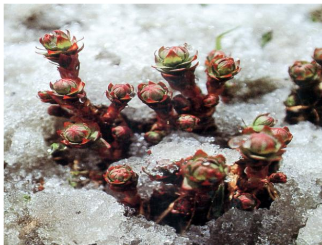
Fig.no 1: Tibetan Rhodiola grows in the snow, above the Himalayan snowline.

Many countries like USA, China, India etc are engaged in the research on Rhodiola and trying drive its application in Pharmaceutical as well as in Defence also but not approved by the Food and Drug Administration (FDA), USA to utilize to cure any disease. In India, the Leh based lab of Defence Research and Development Organization (DRDO) is researching on this wonder herb for longer period so that it can help the soldiers to adjust in the low pressure regions and where oxygen availability is low.