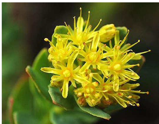
Figure 4: Rhodiola.

secondary metabolites and phytoactive elements which can mitigate the effect of gamma radiations and thus provides protection against the radioactivity.