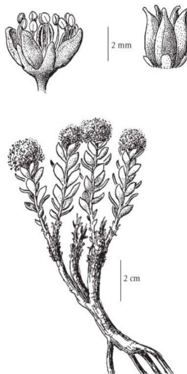
Fig.no 2: Morphology of Rhodiola.