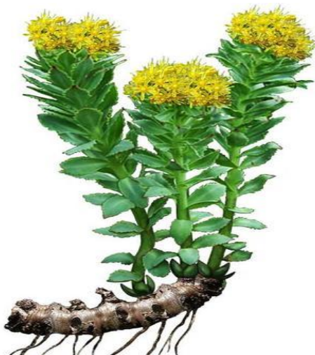
Figure 5: Benefits.

The people of central Asia considered a tea brewed from Rhodiola rosea to be the most effective treatment for cold and flu. Mongolian physicians prescribed it for tuberculosis and cancer.