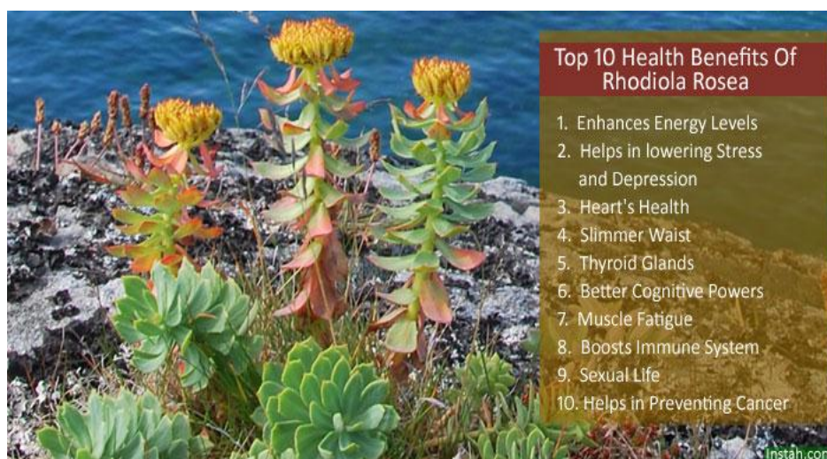
Fig.no 6: Rhodiola with roots.

The leafy parts of the plant were used as a vegetable. But research by Leh-based Defence Institute of High Altitude Research (DIHAR) has shown the herb can help military troops working in high altitudes, such as the 54, 000m Siachen glacier, located in the eastern Karakoram range of the Himalayas.