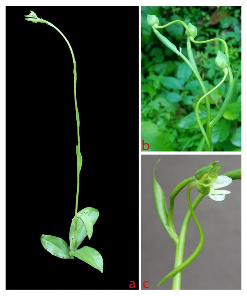
Bioscience Discovery, 10(2):53-57, April - 2019