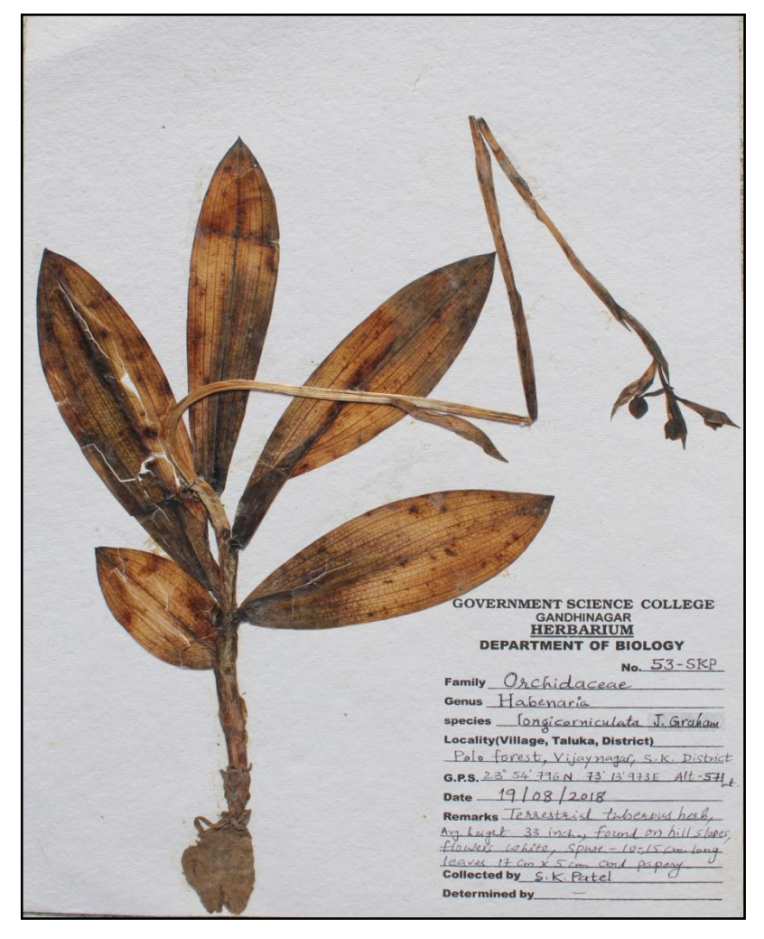
Figure 4. Herbarium specimen of Habenaria longicorniculata J. Graham

Specimen examined: Banaskantha; Jessore Wildlife Sanctuary (24.46500000 N & 72.72916667 E, ca 800 m), PRD-1854, Dt. 27.08.2012; Sabarkantha; Vijaynagar, Zer-Bhankhara forest (24.12111111 N, 73.47027778 E, 571 m), SKP-053, Dt. 19.08.2018